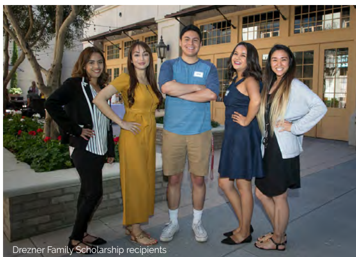
Drezner Family Scholarship recipients

We follow up with you to regularly ensure your charitable goals are being met.