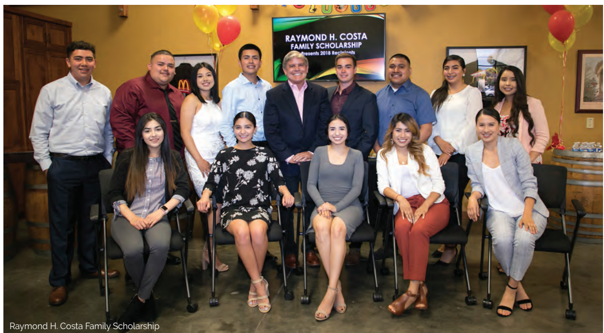
Raymond H. Costa Family Scholarship

We are happy to work with you to develop a customized plan that meets your goals. Please contact us for more information about creative ways to build your philanthropic legacy in partnership with the CFMC.