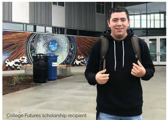
College Futures scholarship recipient

Yes, the CFMC can change the name of a fund. Please get in touch with your Scholarships & Community Impact Officer to submit your request in writing.