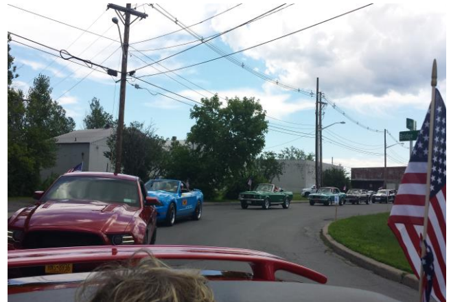
2017 Parade line up in P'burgh