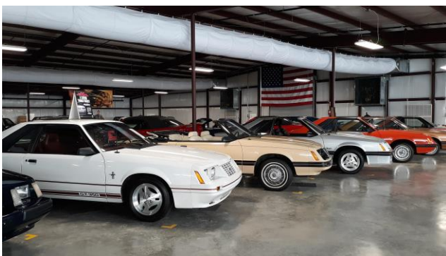
Mustang Museum of America, Odenville AL