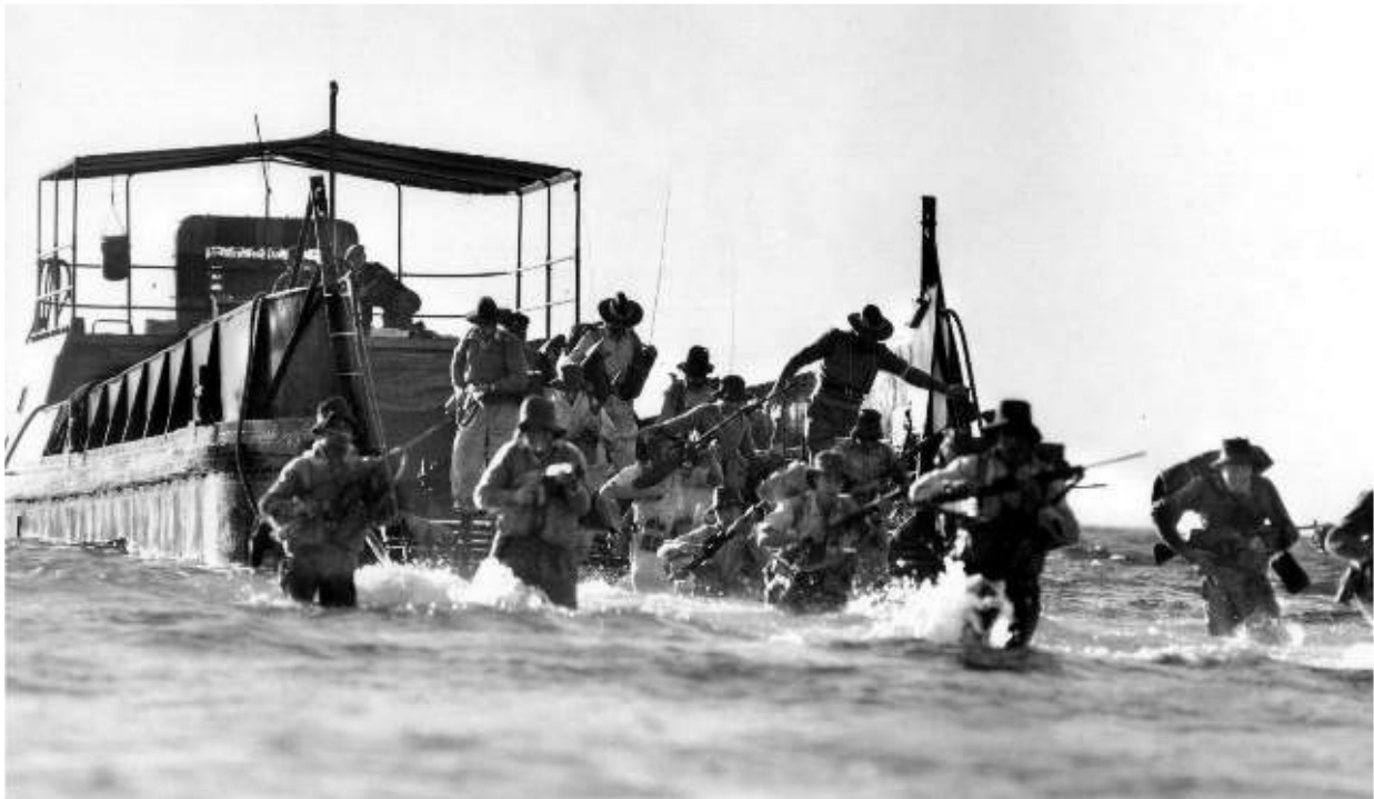
WAUR storm the beach