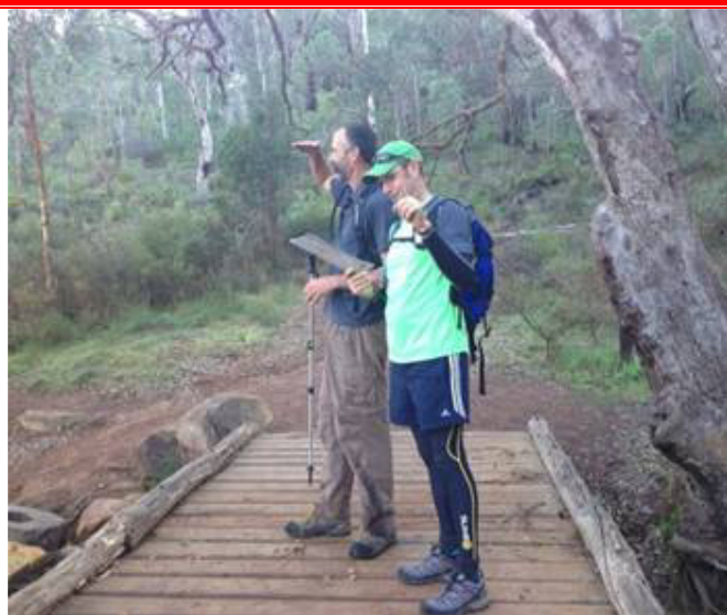
Above: Navigation - no problem - well..... Right: On the walk at Lake Leschenaultia

For details on the event, our team and how to donate go to : https://trailwalker.oxfam.org.au/team/blog/18466#22775