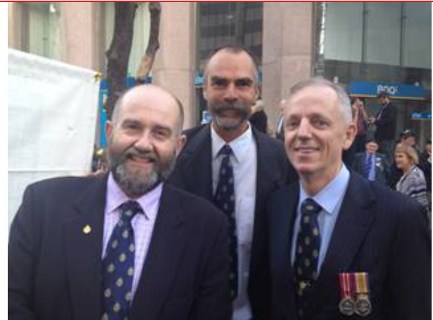
ANZAC Day 2014 - Together again