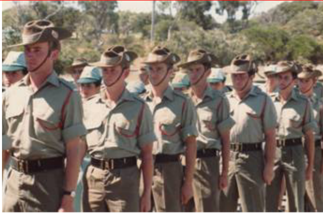
Left: 1982 April Gradation Parade Below: 1985 Northam M60 Range