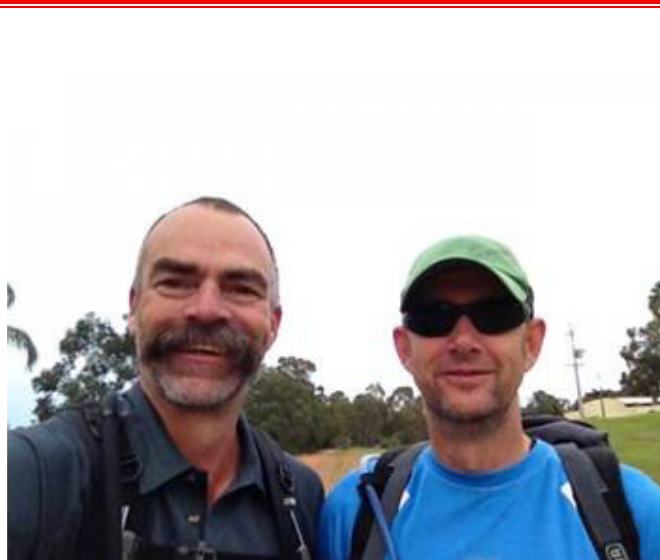
Once were WAURiors!