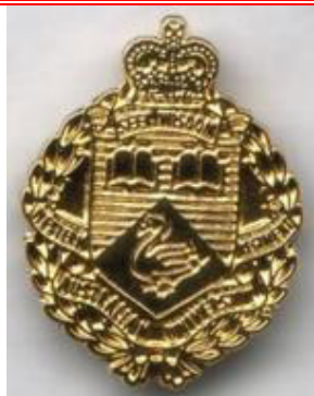
Left: Tie Pin, Below Tie Bar. Right Shirt Crest