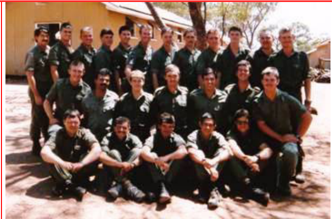
1985 Northam AETPlatoon