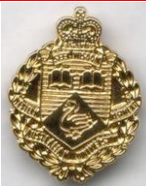
Left: Tie Pin, Below Tie Bar. Right Shirt Crest