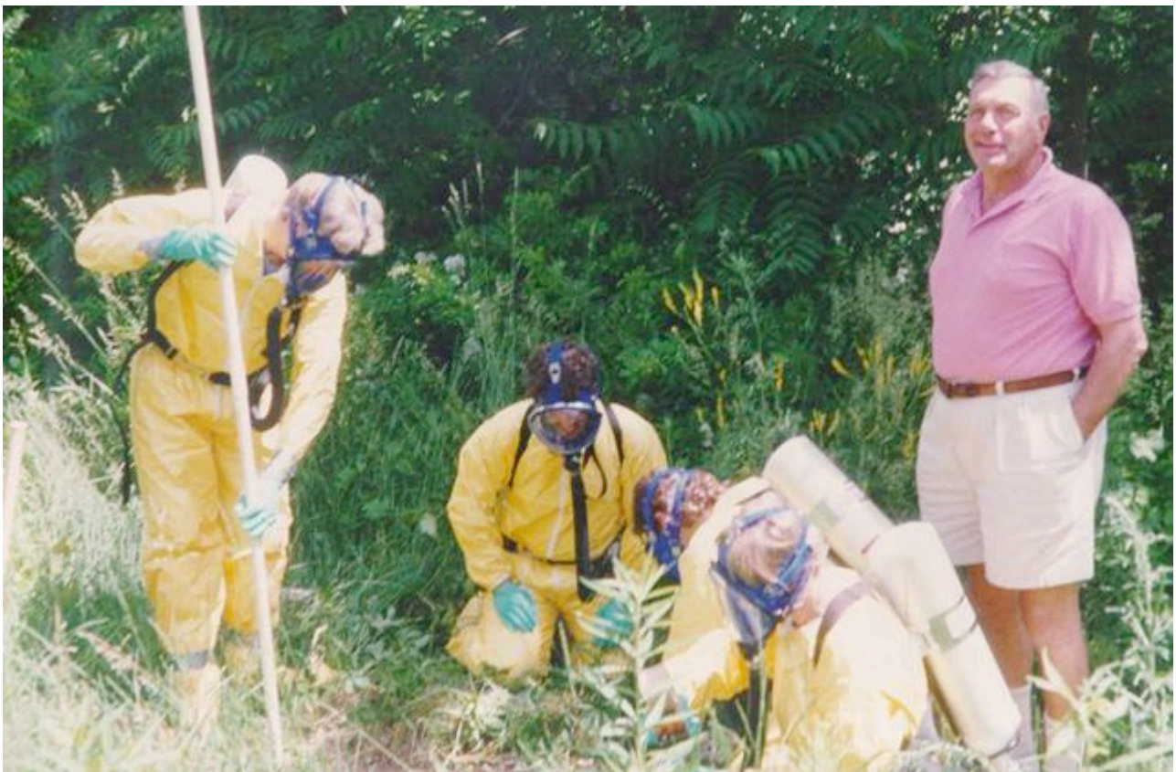
Spot the Safety Officer....

The next morning, his wife, Jess, comes into the room carrying a cup of coffee and says, "Get up Paddy. Did you have a bit to drink last night?" Paddy says, "I did, Jess, I did. I was fockin' pissed, and how did you know?" "Mick the bartender phoned . . . Yuh left your wheelchair at the pub."