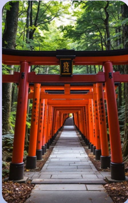
FUSHIMI INARI SHRINE