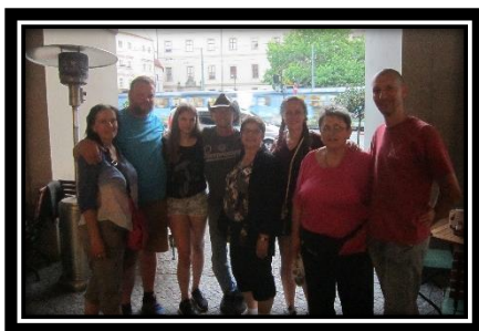
Group photo with Polashek relatives