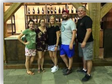
Family photo at Pilsner Urquell Brewery