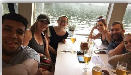
Family photo opp at Lod' Pivovar