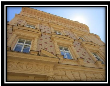
Apartment Building Featured in Kojan

Fun Fact: While in Prague, our home was an attic apartment in the house where the Czech movie "Koja" was filmed. It won the 1996 Oscar award for Best International Movie of the Year. The big excitement of this apartment was that we had to walk up or down 123 steps either to go home or go out! It was a challenging exercise for us but thank goodness for our Sokol fitness training.