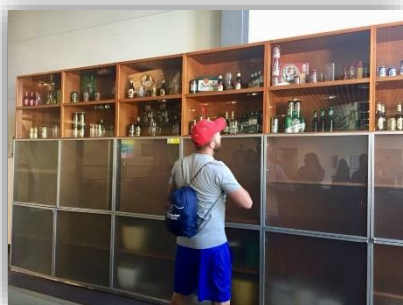
Admiring pivo options