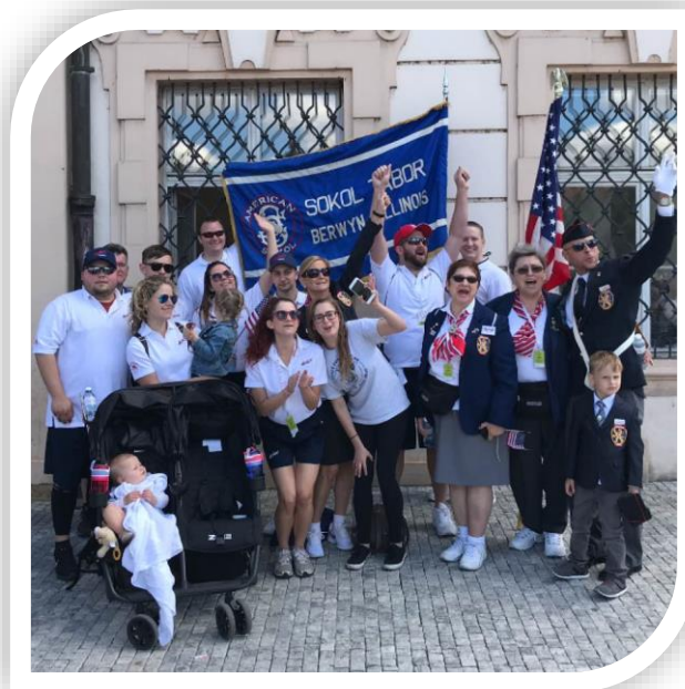
Sokol Tabor members gather for a photo opportunity after the Slet Parade