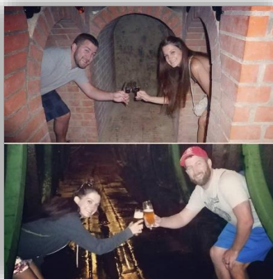
6 years later! Znojmo 2012 (top) vs Plzen 2018 (bottom)