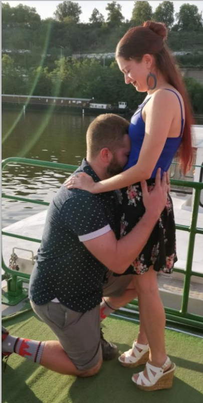
My Announcement on the American Sokol 4 th of July boat cruise on the Vltava River