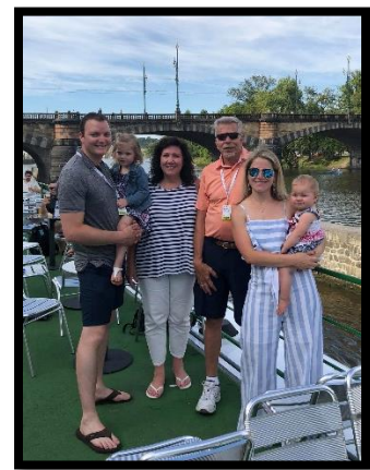
Family Photo on Vltava River Boat Cruise