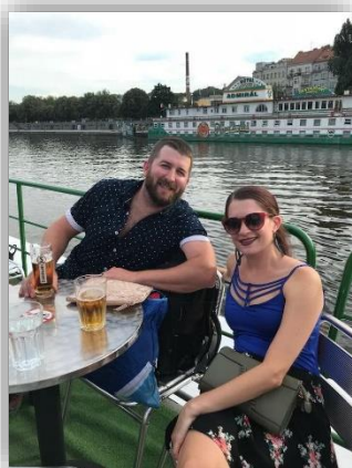
Pivos on Vltava boat cruise