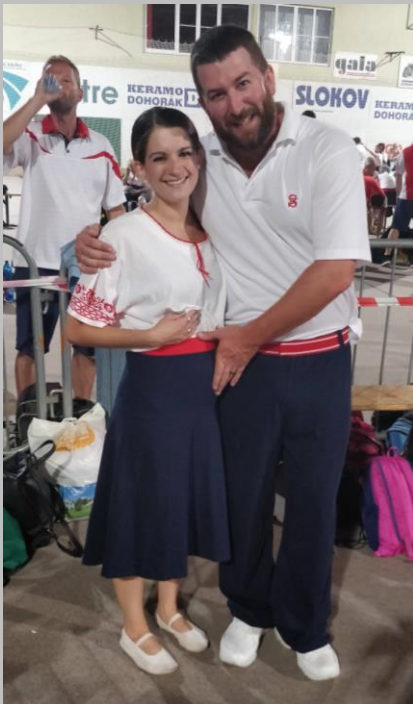
Getting Ready for Princezna Republika Cal