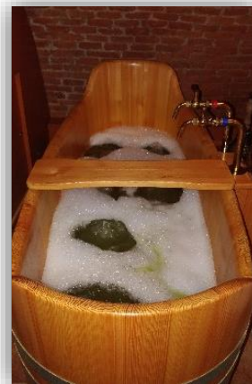
Tub of hops!