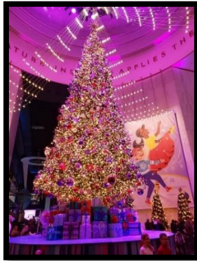
Museum of Science and Industry