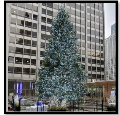
Tribune Tower – Chicago