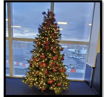
LaGuardia Airport – Queens, NY