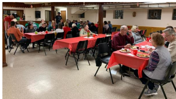
Members enjoying their meal