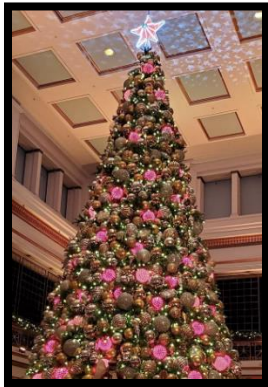
Macy's – Walnut Room – Chicago