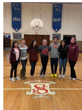
Junior Class Photo

SAVE THE DATE: JUNIOR BOARD MOVIE NIGHT – JANUARY 29, 2020 FEATURED MOVIE: FROZEN