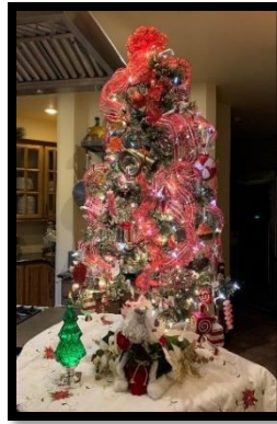
Suzette's Creperie Wheaton, IL