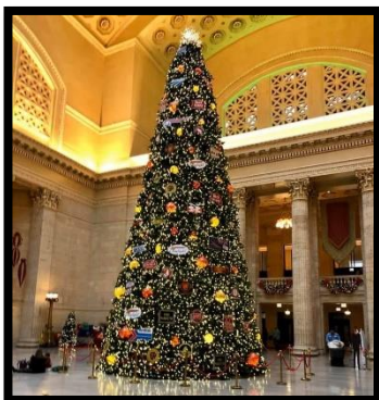
Union Station – Chicago, IL