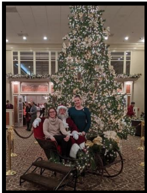
Drury Lane Theatre – Oak Brook