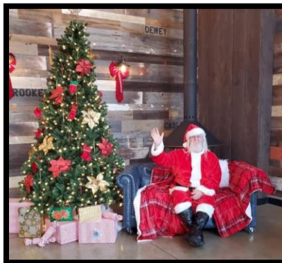
The Strand Brewery – Dowagiac, MI