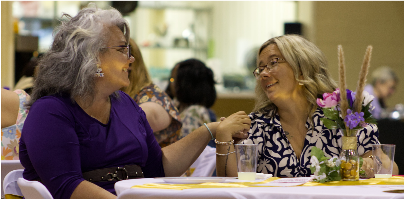
Child care providers enjoy Columbus County Partnership for Children's annual Provider Appreciation Banquet.