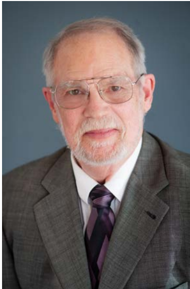
Members of the California – Hawaii Elks Association:

During the past three years, our Lodges faced challenges from a pandemic which resulted in mandated Lodge shuttering, changes and restrictions in activities; member, public health, and safety requirements; all-volunteer help; revenue interruption; and changing business models. We met the challenges by having “Stepped up to a New Age”; by more deeply understanding that “The Future of Elkdom Began with Each of Us”; and that post-pandemic rebuilding would entail the importance of “ Building Elks’ Legacy: Lodge, Membership, and Community Service ”.