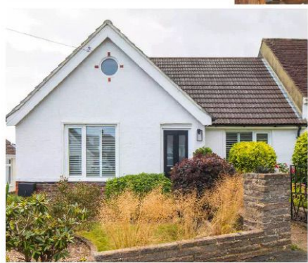
▲ For a modern twist on the 1930s exterior, Victoria replaced her front door with a black design and fitted a contemporary light

After rejecting properties that were already done up, Victoria became drawn to a dated chalet bungalow, a couple of streets away from Harriet and Luke. The four-bed had a large garden, a modest kitchen extension and small loft conversion with two bedrooms. The owner had lived there for 50 years, and little