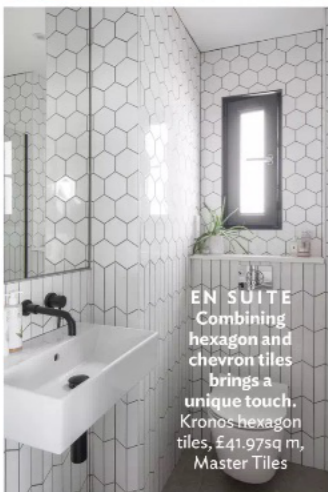
EN SUITE Combining hexagon and chevron tiles brings a unique touch. Kronos hexagon tiles, £41.97sq m, Master Tiles