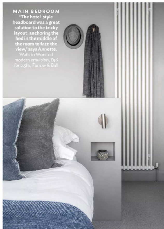
MAIN BEDROOM 'The hotel-style headboard was a great solution to the tricky layout, anchoring the bed in the middle of the room to face the view,' says Annette. Walls in Worsted modern emulsion, £56 for 2.5ltr, Farrow & Ball