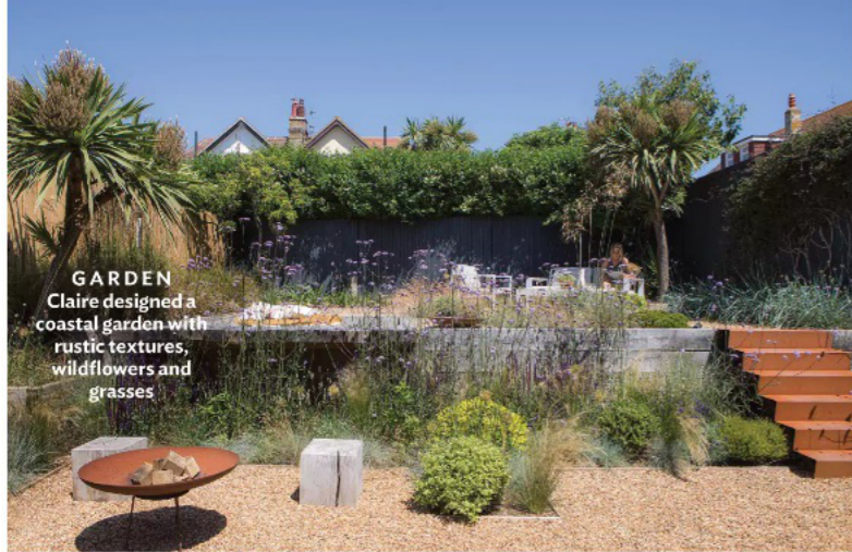
GARDEN Claire designed a coastal garden with rustic textures, wildflowers and grasses.