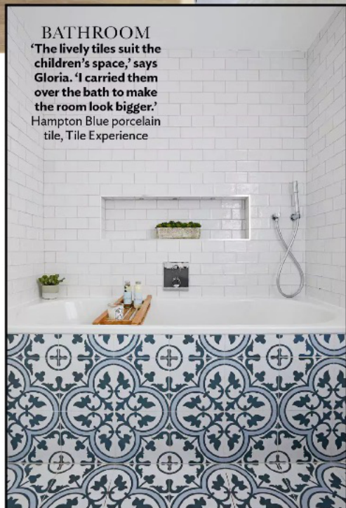
BATHROOM 'The lively tiles suit the children's space,' says Gloria. 'I carried them over the bath to make the room look bigger.' Hampton Blue porcelain tile, Tile Experience