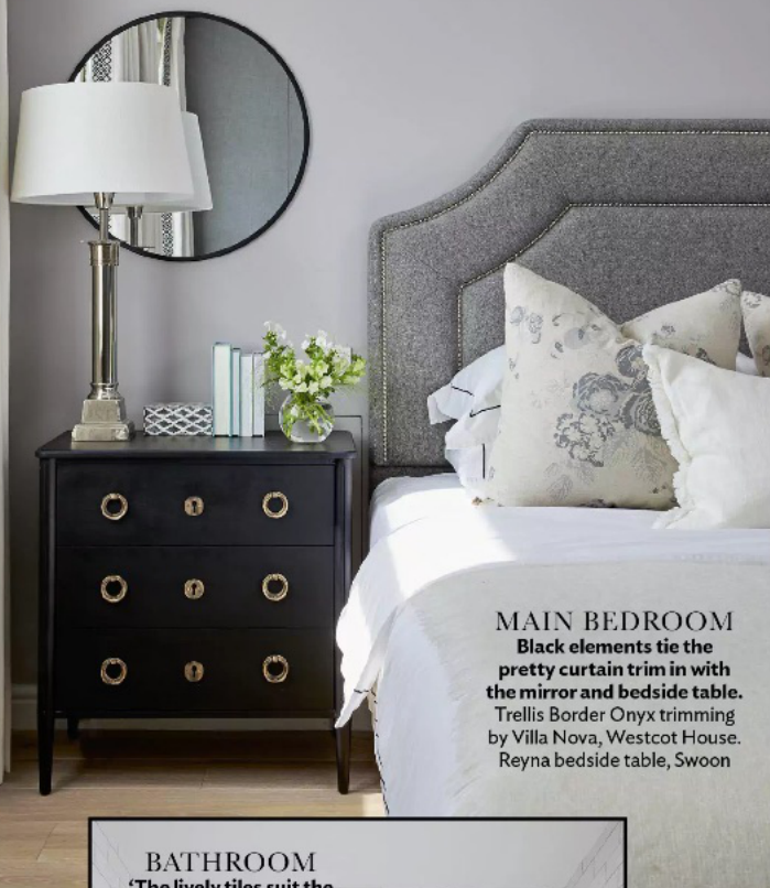
MAIN BEDROOM Black elements tie the pretty curtain trim in with the mirror and bedside table. Trellis Border Onyx trimming by Villa Nova, Westcot House. Reyna bedside table, Swoon

'I WAS INSPIRED BY MONOCHROME AND CALM HOTEL BEDROOMS WITH A BIG BED AND ELEGANT SIDE TABLES'