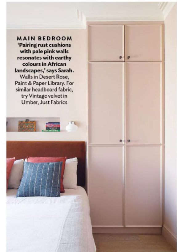
MAIN BEDROOM 'Pairing rust cushions with pale pink walls resonates with earthy colours in African landscapes,' says Sarah. Walls in Desert Rose, Paint & Paper Library. For similar headboard fabric, try Vintage velvet in Umber, Just Fabrics

Sarah sourced cushions from a fair trade co-operative in Ethiopia where they farm silkworms, weave their own textiles and use natural dyes. She discovered African art from The Studio Museum in Harlem's Studio Store, the Lori Austin Gallery and Etsy. She's delighted there's a coherence to their collection now. 'Before, our African art looked lost and unappreciated but now each room is a highly designed space that's just for us – I love it all.' 25