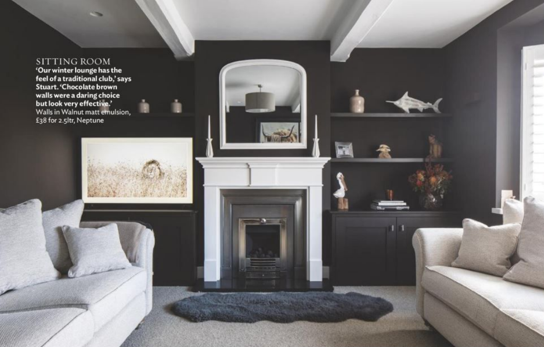
SITTING ROOM 'Our winter lounge has the feel of a traditional club,' says Stuart. 'Chocolate brown walls were a daring choice but look very effective.' Walls in Walnut matt emulsion, £38 for 2.5ltr, Neptune

DESIGN TIP 'Investing in a lighting designer was such a good decision and the results have been one of the success stories in our project'