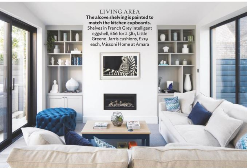
LIVING AREA The alcove shelving is painted to match the kitchen cupboards. Shelves in French Grey intelligent eggshell, £66 for 2.5ltr, Little Greene. Jarris cushions, £219 each, Missoni Home at Amara