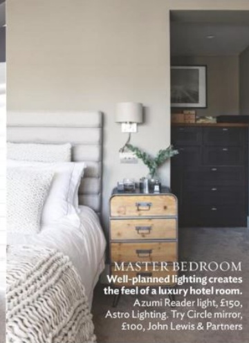
MASTER BEDROOM Well-planned lighting creates the feel of a luxury hotel room. Azumi Reader light, £150, Astro Lighting. Try Circle mirror, £100, John Lewis & Partners