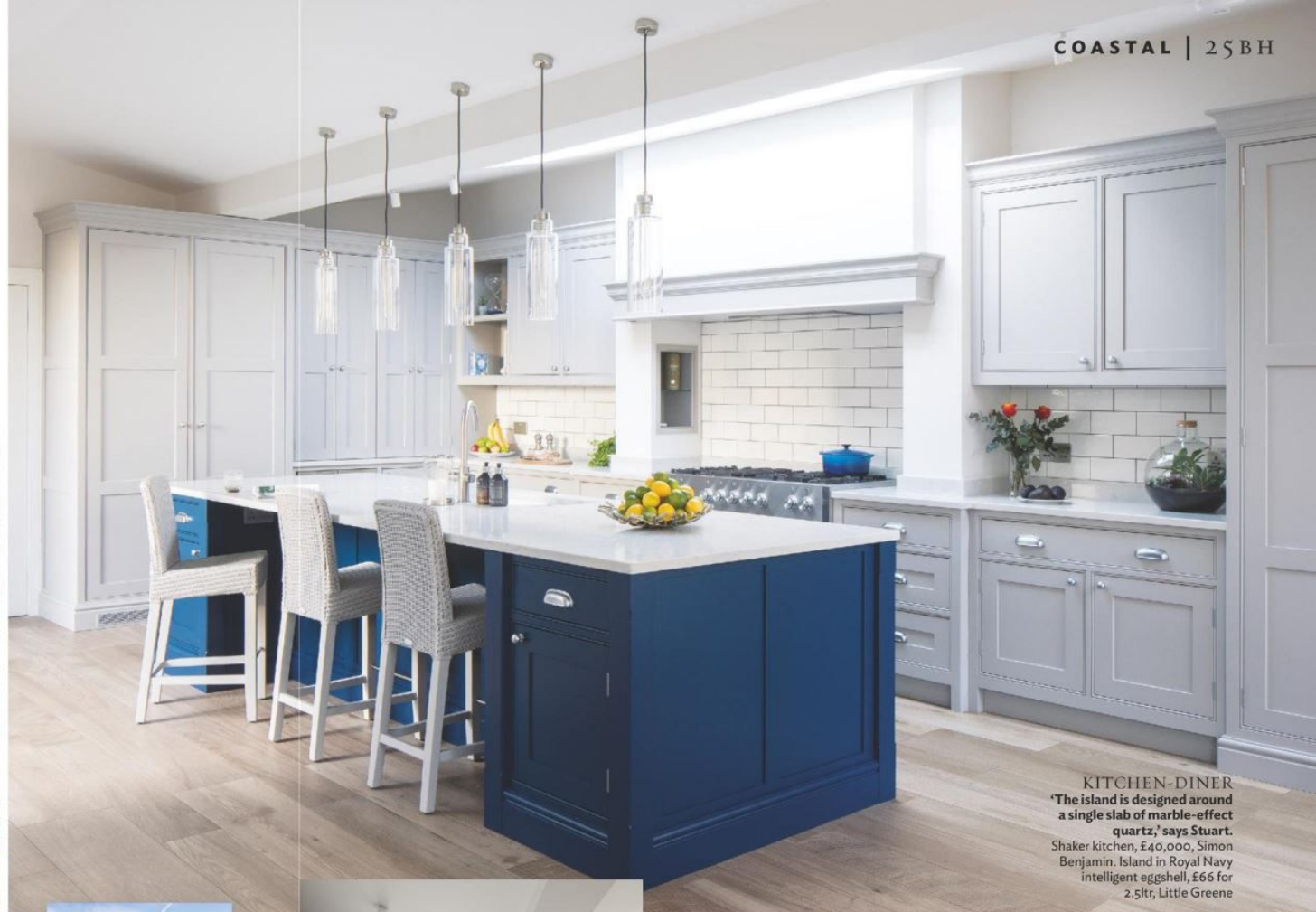
KITCHEN-DINER 'The island is designed around a single slab of marble-effect quartz,' says Stuart. Shaker kitchen, £40,000, Simon Benjamin. Island in Royal Navy intelligent eggshell, £66 for 2.5ltr, Little Greene