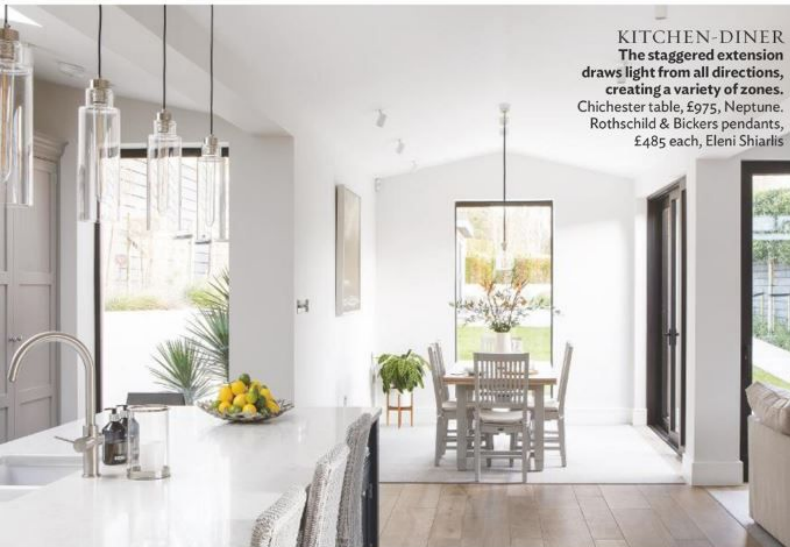
KITCHEN-DINER The staggered extension draws light from all directions, creating a variety of zones. Chichester table, £975, Neptune. Rothschild & Bickers pendants, £485 each, Eleni Shiarlis