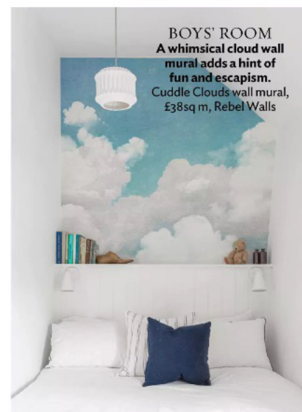
BOYS' ROOM A whimsical cloud wall mural adds a hint of fun and escapism. Cuddle Clouds wall mural, £38sq m, Rebel Walls