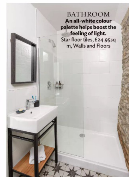
BATHROOM An all-white colour palette helps boost the feeling of light. Star floor tiles, £24.95sq m, Walls and Floors

door into a single-storey 1970s extension with a kitchen and bathroom, felt disappointing. Then they stepped through to the sitting room. 'We looked around and fell in love with the exposed, thick stone walls and deep windowsills,' says Abi. 'Afterwards we sat in the local pub, with the fire lit and fairy lights around the window, and both knew we wanted to make the cottage work for us.'