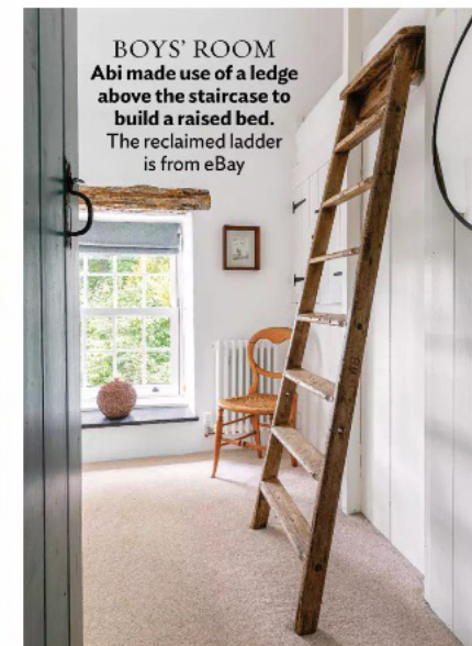
BOYS' ROOM Abi made use of a ledge above the staircase to build a raised bed. The reclaimed ladder is from eBay