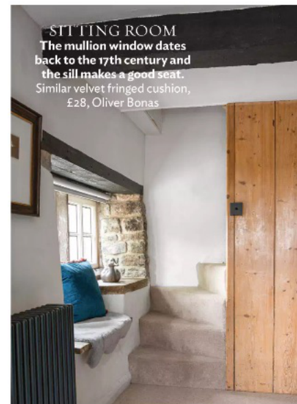
SITTING ROOM The mullion window dates back to the 17th century and the sill makes a good seat. Similar velvet fringed cushion, £28, Oliver Bonas