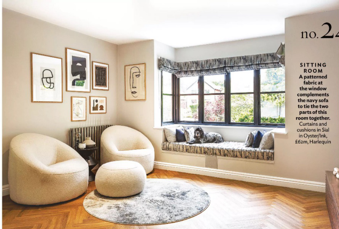
SITTING ROOM A patterned fabric at the window complements the navy sofa to tie the two parts of this room together. Curtains and cushions in Sial in Oyster/Ink, £62m, Harlequin