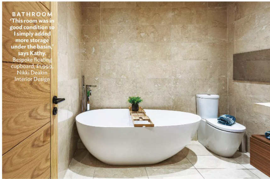
BATHROOM 'This room was in good condition so I simply added more storage under the basin,' says Kathy. Bespoke floating cupboard, £1,999, Nikki Deakin Interior Design

BIGGEST SUCCESS 'Changing the interior doors to oak and fitting them with black handles modernised the whole look of the house'