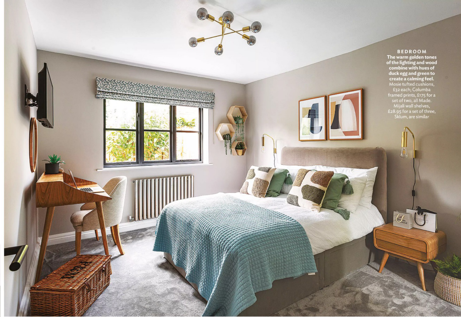
BEDROOM The warm golden tones of the lighting and wood combine with hues of duck egg and green to create a calming feel. Mosie tufted cushions, £32 each; Columba framed prints, £175 for a set of two, all Made. Mijali wall shelves, £28.95 for a set of three, Sklum, are similar

BIGGEST SUCCESS 'Changing the interior doors to oak and fitting them with black handles modernised the whole look of the house'