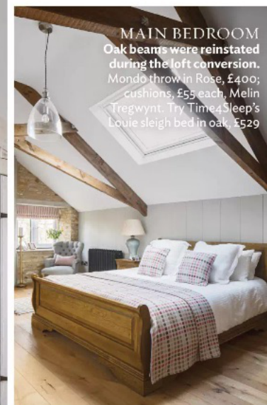
MAIN BEDROOM Oak beams were reinstated during the loft conversion. Mondo throw in Rose, £400; cushions, £55 each, Melin Tregwynt. Try Time4Sleep's Louie sleigh bed in oak, £529