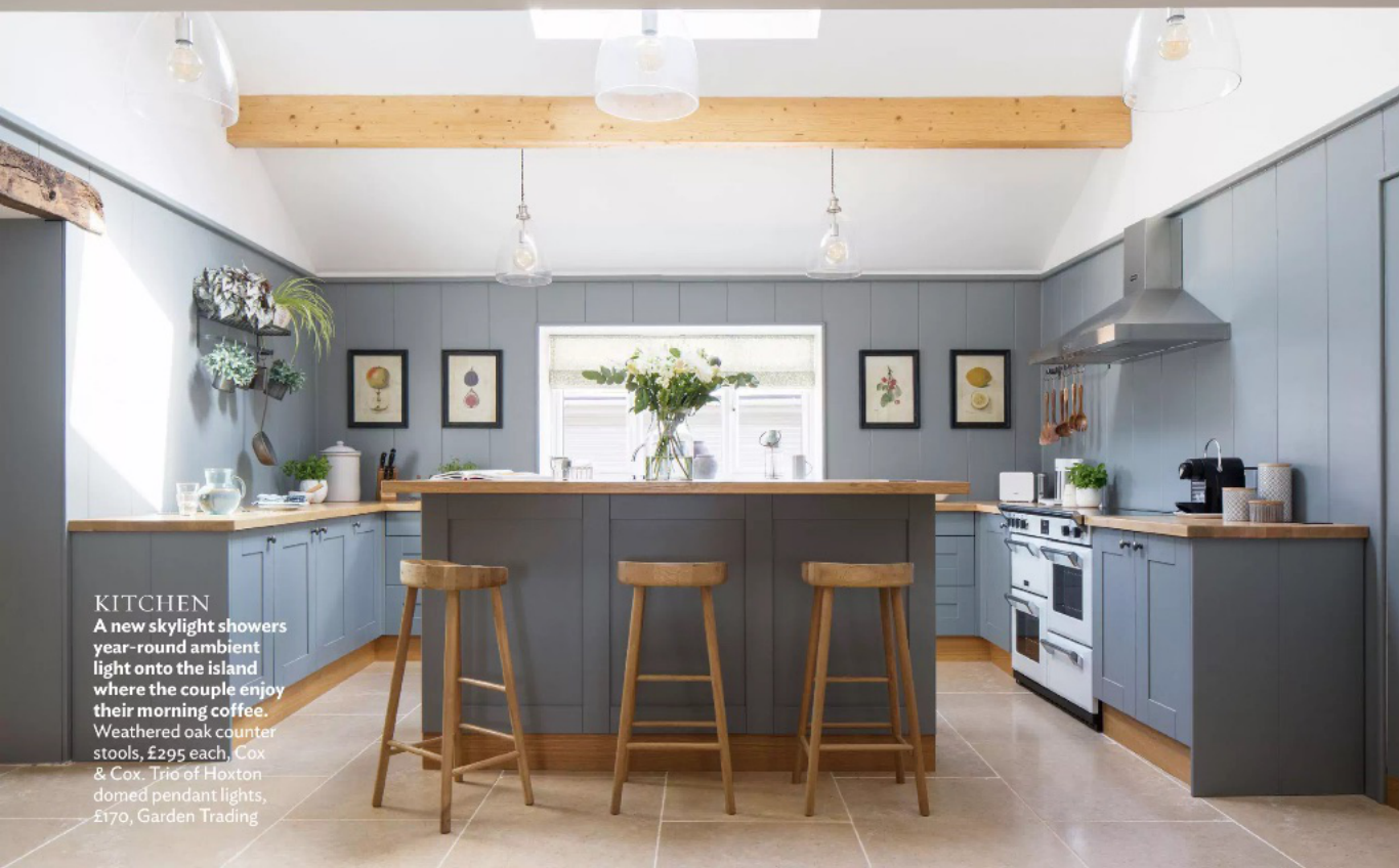
KITCHEN A new skylight showers year-round ambient light onto the island where the couple enjoy their morning coffee. Weathered oak counter stools, £295 each, Cox & Cox. Trio of Hoxton domed pendant lights, £170, Garden Trading