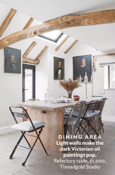
DINING AREA Light walls make the dark Victorian oil paintings pop. Refectory table, £1,000, Threadgold Studio