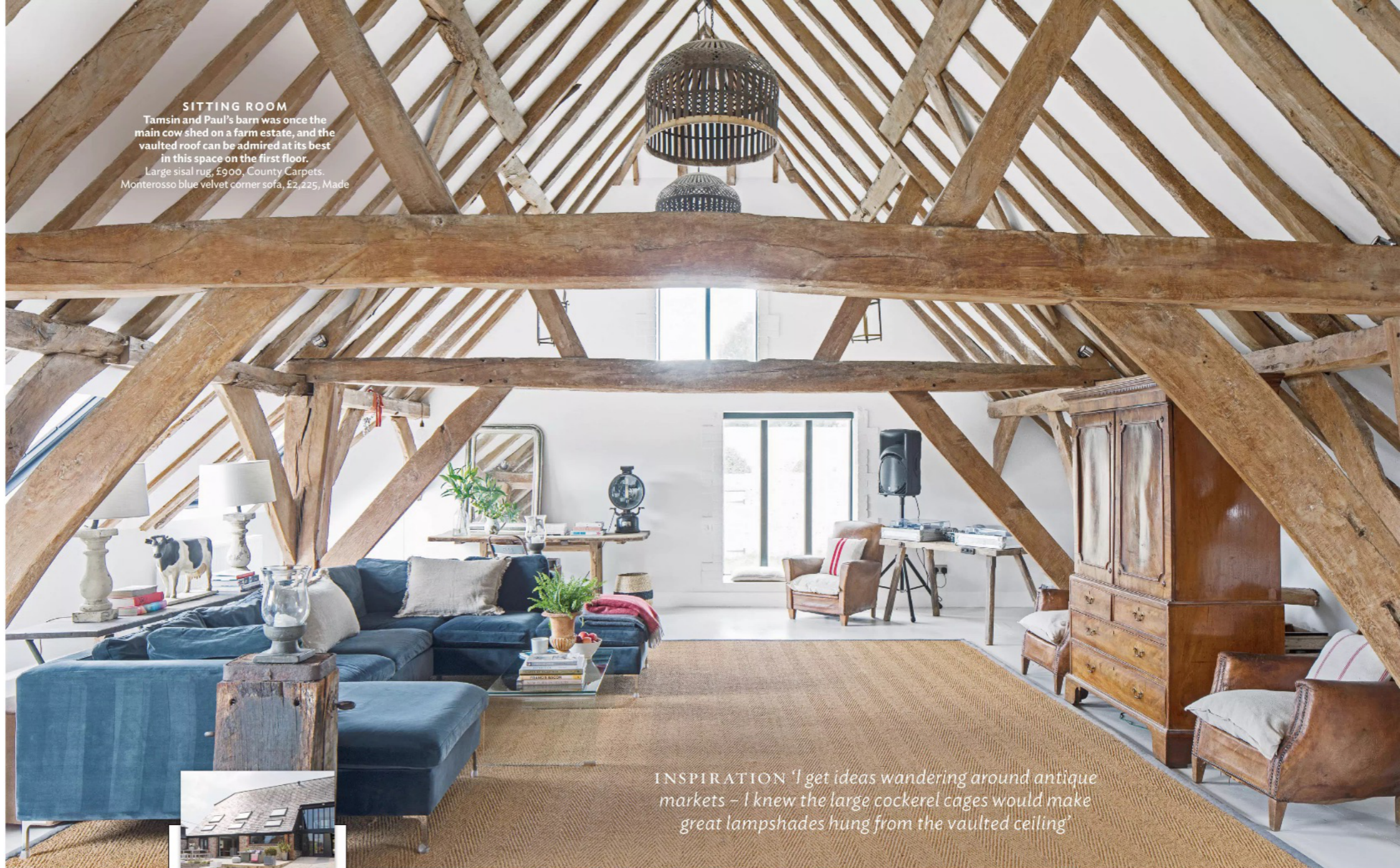
SITTING ROOM Tamsin and Paul's barn was once the main cow shed on a farm estate, and the vaulted roof can be admired at its best in this space on the first floor. Large sisal rug, £900, County Carpets. Monterosso blue velvet corner sofa, £2,225, Made

INSPIRATION 'I get ideas wandering around antique markets – I knew the large cockerel cages would make great lampshades hung from the vaulted ceiling'