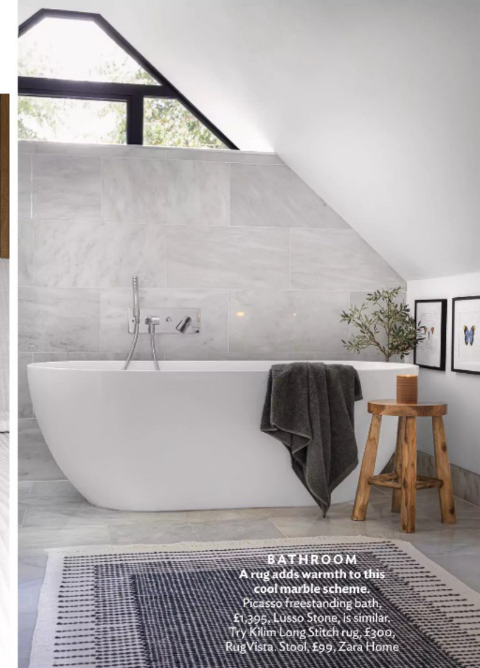
BATHROOM A rug adds warmth to this cool marble scheme. Picasso freestanding bath, £1,395, Lusso Stone, is similar. Try Kilim Long Stitch rug, £300, RugVista. Stool, £99, Zara Home