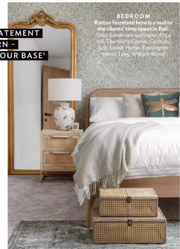
BEDROOM Rattan furniture here is a nod to the clients' time spent in Bali. Osier Sanderson wallpaper, £75 a roll, The Niche Corner. Cushion, £20, Lavish Home. Kensington mirror, £295, William Wood