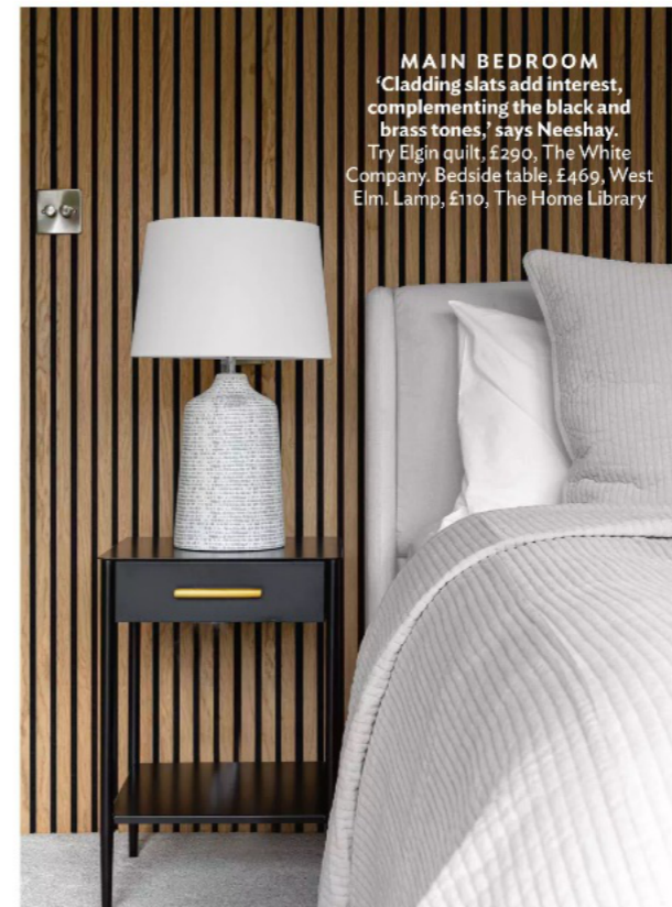
MAIN BEDROOM 'Cladding slats add interest, complementing the black and brass tones,' says Neeshay. Try Elgin quilt, £290, The White Company. Bedside table, £469, West Elm. Lamp, £110, The Home Library