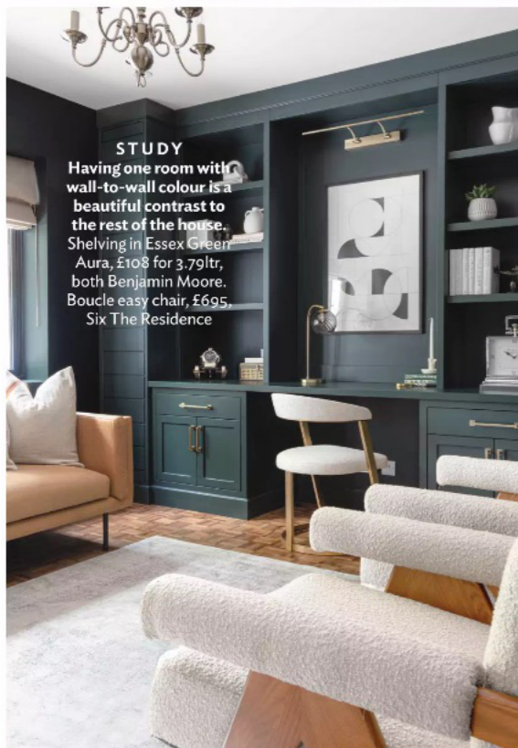
STUDY Having one room with wall-to-wall colour is a beautiful contrast to the rest of the house. Shelving in Essex Green Aura, £108 for 3.79ltr, both Benjamin Moore. Boucle easy chair, £695, Six The Residence