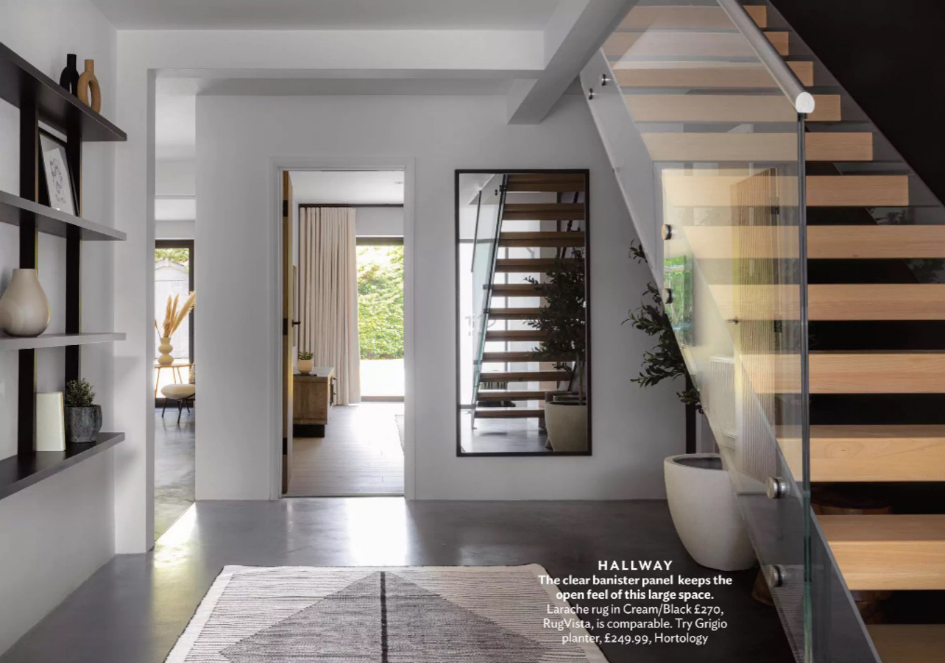
HALLWAY The clear banister panel keeps the open feel of this large space. Larache rug in Cream/Black £270, RugVista, is comparable. Try Grigio planter, £249.99, Hortology