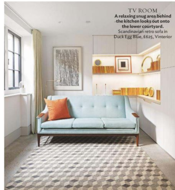
TV ROOM A relaxing snug area behind the kitchen looks out onto the lower courtyard. Scandinavian retro sofa in Duck Egg Blue, £625, Vinterior

HOME TRUTHS THE PROPERTY Victorian terraced house LOCATION Central London ROOMS Sitting room, kitchen-diner/living area, TV room, study, utility room, three bedrooms (all en suite), dressing room, shower room PURCHASED 2015 PREVIOUS PROPERTY 'I was living in a Victorian terrace in Waterloo,' says James.