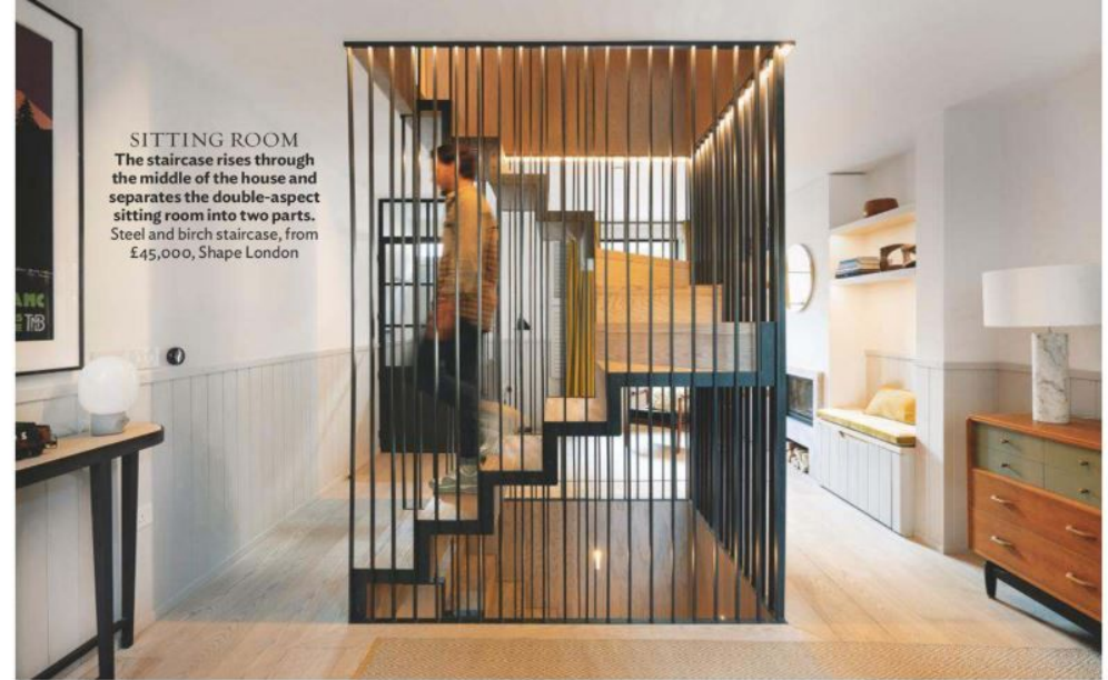
SITTING ROOM The staircase rises through the middle of the house and separates the double-aspect sitting room into two parts. Steel and birch staircase, from £45,000, Shape London