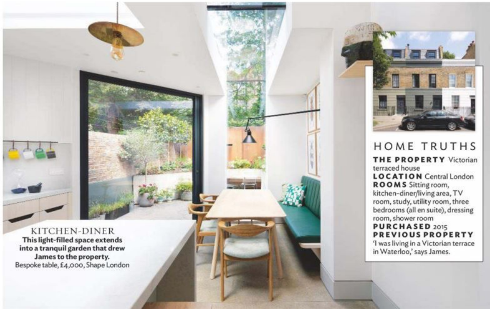
KITCHEN-DINER This light-filled space extends into a tranquil garden that drew James to the property. Bespoke table, £4,000, Shape London

buying a loft apartment for myself, but I was taken with the wonderful triangular garden,' he says. 'It's a green, tranquil space where you can hear the birds, and yet only streets away from the creative buzz of King's Cross.' James set out a practical brief for Lizzie and Joe to interpret – an attic master bedroom suite with dressing room, two en-suite bedrooms on the