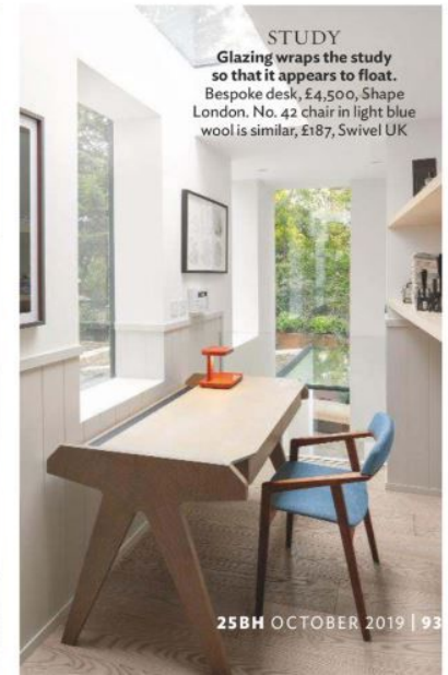
STUDY Glazing wraps the study so that it appears to float. Bespoke desk, £4,500, Shape London. No. 42 chair in light blue wool is similar, £187, Swivel UK