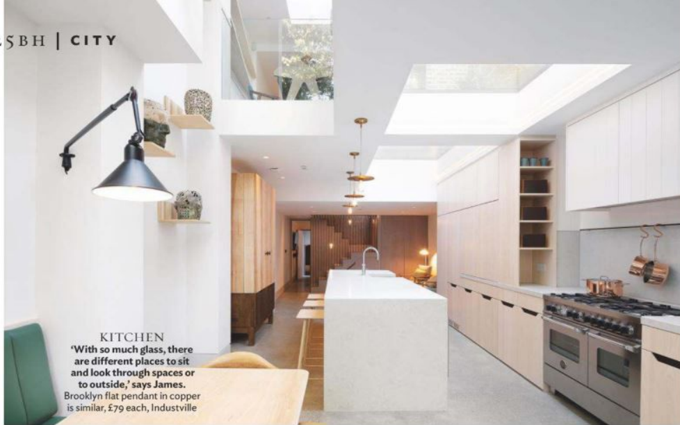
KITCHEN 'With so much glass, there are different places to sit and look through spaces or to outside,' says James. Brooklyn flat pendant in copper is similar, £79 each, Industville