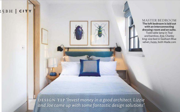
MASTER BEDROOM The loft bedroom is laid out with an interconnecting dressing-room and en suite. Todd table lamp in Teal and bamboo, £39; Charley king-size bed in Sealoom Blue velvet, £499, both Made.com

DESIGN TIP 'Invest money in a good architect. Lizzie and Joe came up with some fantastic design solutions'