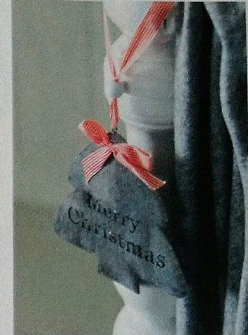
ABOVE, CLOCKWISE FROM TOP LEFT Fish candles cast a soft light; the use of white in the bathroom draws the eye towards the grey vanity unit; all the Christmas decorations are in keeping; the 'Wave' throw is from Sioni Rhys Handweavers