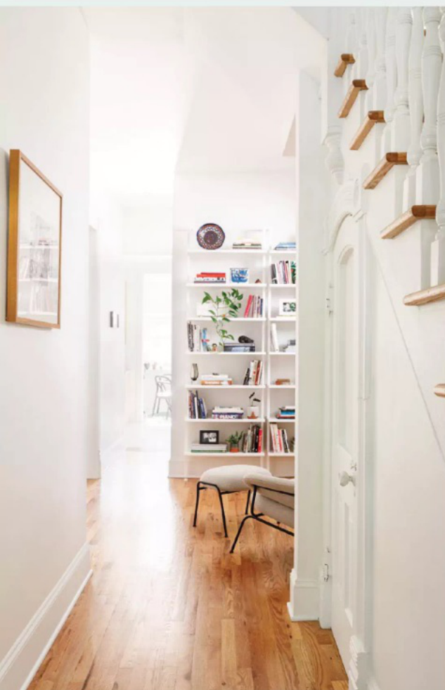
ABOVE Walls lined with bookshelves and a comfy armchair turned an open area at the far end of the entrance hall into a cosy reading nook. The door beneath the staircase leads down to a basement laundry room

'My plan was to preserve as many of the original spaces as possible, only making significant changes to the newer additions'