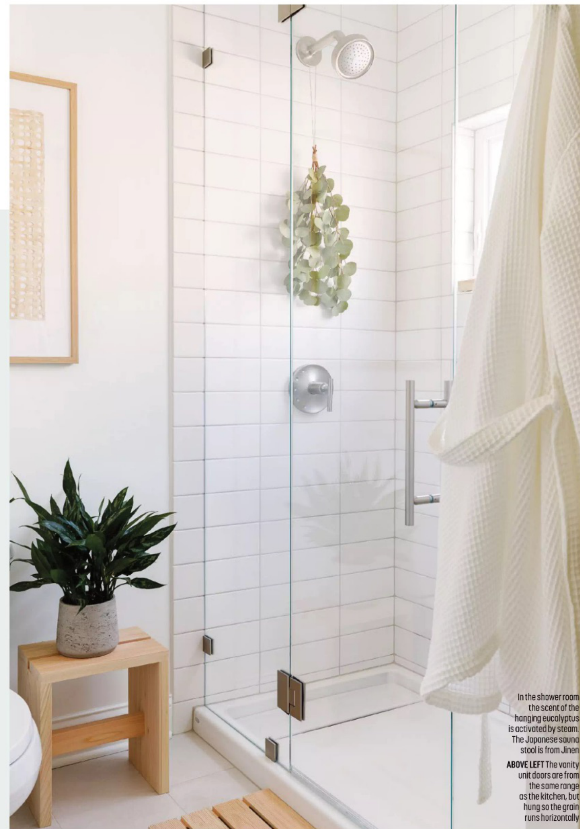
In the shower room the scent of the hanging eucalyptus is activated by steam. The Japanese sauna stool is from Jinen

Danielle carried on with her fulltime job while project managing both build phases to make sure everything ran smoothly. It wasn't all without incident though, particularly when the temperature dropped below freezing just as >>