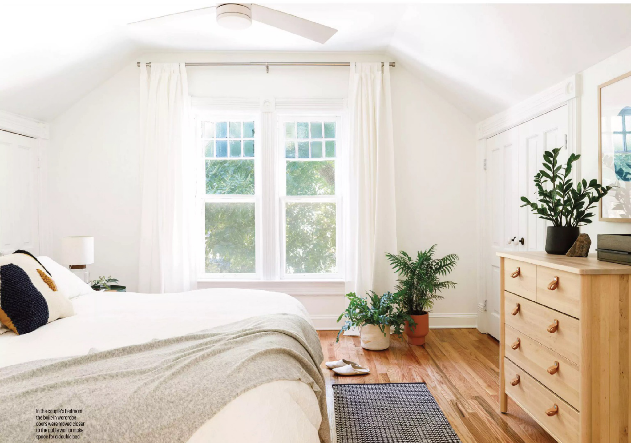
In the couple's bedroom the built-in wardrobe doors were moved closer to the gable wall to make space for a double bed