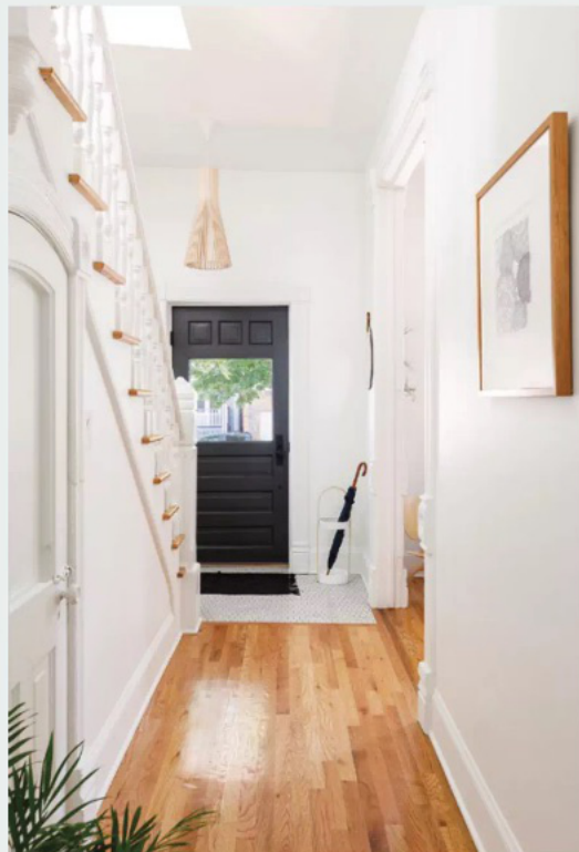
ABOVE The architrave around the front door is new. It was made to match the original Victorian woodwork in the downstairs rooms