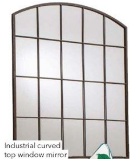
Industrial curved top window mirror £150 Cox & Cox