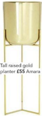
Tall raised gold planter £55 Amara