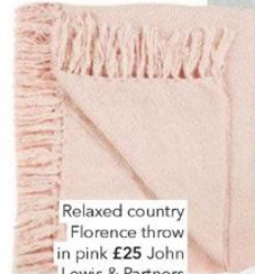
Relaxed country Florence throw in pink £25 John Lewis & Partners