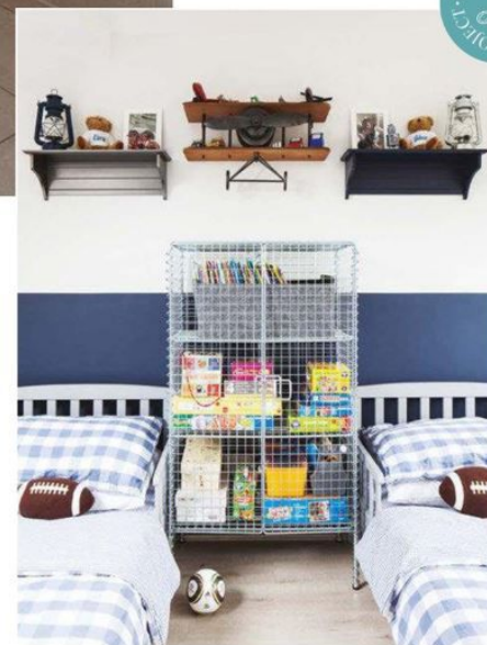
▲ Twins' bedroom. Nicola has dressed Gideon and Ezra's loft bedroom with chequered bedlinen from The White Company, and used a grey locker (try Wayfair for similar) for storing toys