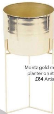
Moritz gold metal planter on stand £84 Artisanti