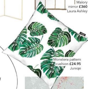
Monstera pattern cushion £24.95 Junique