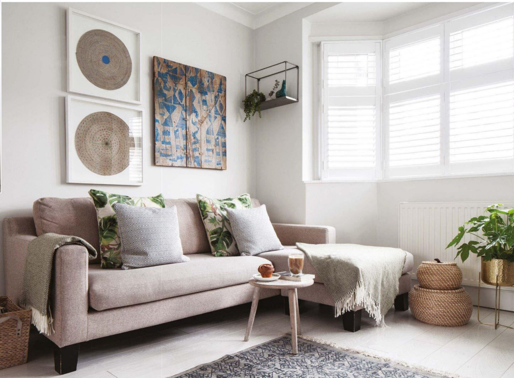
▼ Living room Botanical green cushions and a blue rug from Homesense infuse colour into the neutral space, together with an unusual wall display made up of a repurposed piece of old door from South Africa, which Nicola has teamed with framed African straw pot holders

'The couple got to work on their project as soon as they moved in, focusing on the upstairs first, and replacing the carpets with a soft washed wood laminate flooring for durability. As this is a family home, a lot of my decisions were led by practicality, so everything has to work for the children, too,' says Nicola. 'The laminate planks can take lots of wear and tear! ▶