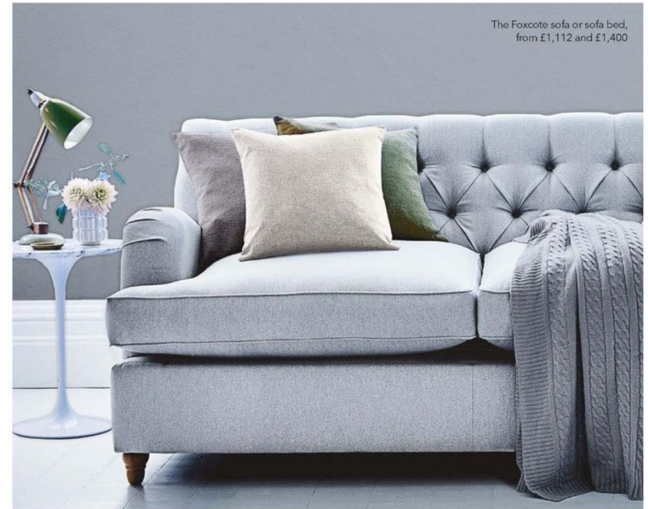
The Foxcote sofa or sofa bed, from £1,112 and £1,400

Refresh your home in time for spring with a sofa bed, sofa or armchair from Willow & Hall