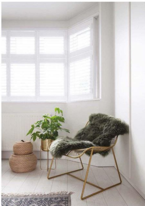
▲ Metallic accents A gold chair topped with a faux-fur throw, both from Graham & Green, and an embossed metal planter add a contemporary edge to the more rustic wicker and wooden accessories in the living room

woven baskets are just some of her finds. 'At work I like to build a design idea from something personal our clients love, and I've done the same in my home,' she explains. 'I always go to the markets when I'm back in South Africa. Local people are very creative and sell repurposed homewares and things they've made using beadwork or indigenous fabrics. It's lovely to support their work and have pieces in our house that you wouldn't see everywhere else – they remind us of home and make great conversation pieces.'