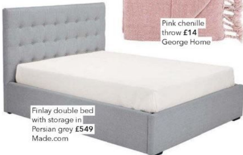
Finlay double bed with storage in Persian grey £549 Made.com