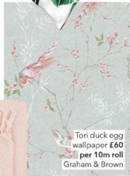
Tori duck egg wallpaper £60 per 10m roll Graham & Brown