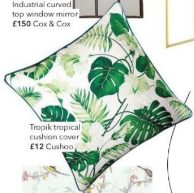
Tropik tropical cushion cover £12 Cushoo