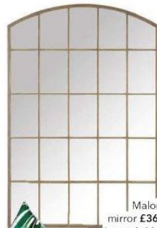
Malory mirror £360 Laura Ashley