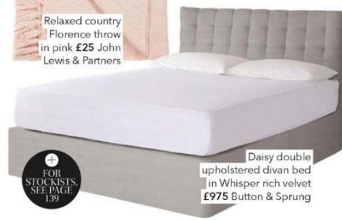
Daisy double upholstered divan bed in Whisper rich velvet £975 Button & Sprung