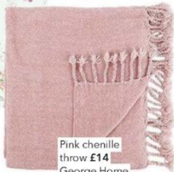
Pink chenille throw £14 George Home