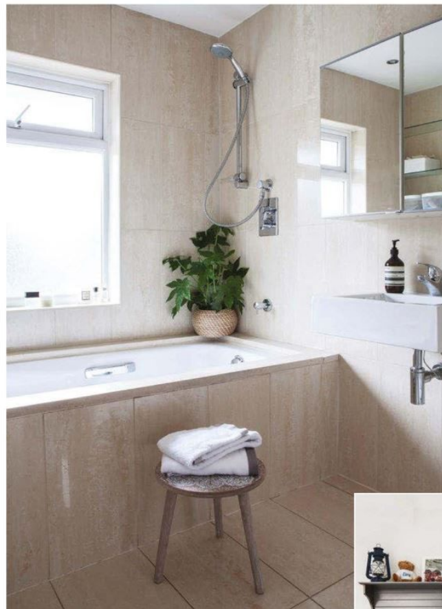
▲ Bathroom. A simple warm taupe scheme has been easy to live with while the rest of the house took priority. Nicola has used plants to soften the large format tiles, adding an embossed stool she bought from Portobello Road Market in Notting Hill

Nicola and Ian had planned to update the bathrooms in due course, but an unexpected leak in the master en suite meant they needed to tackle the rooms sooner than expected. 'I had to choose everything in a bit of a rush,' recalls Nicola. 'But fortunately, I had good contacts with suppliers through work, who were able to turn things around quite quickly.'