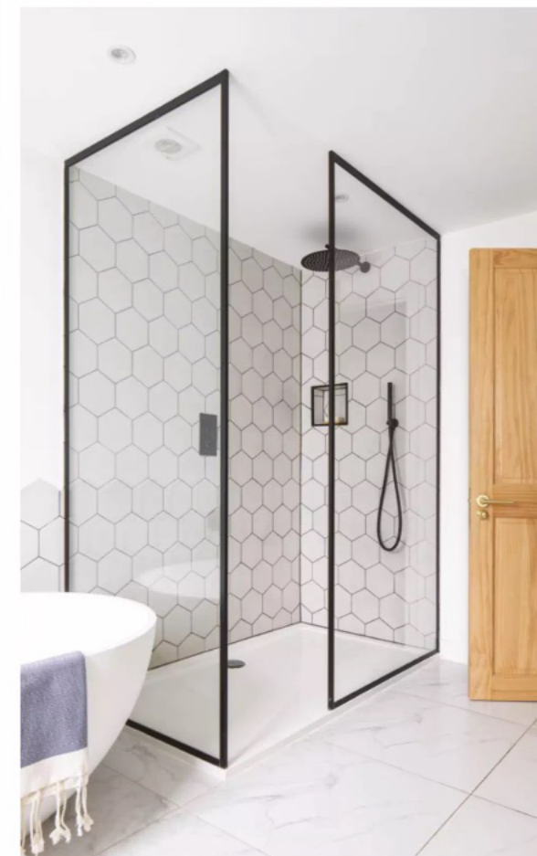
▼ Walk-in shower Hexagonal tiles add interest to this corner of the bathroom; for a similar design, try the Aspect Grey tile at Walls and Floors. The bespoke black-trim screen is by Spiral Hardware, and for similar black sanitaryware, try Drench

resulting in an expensive solution to re-route the pipes. 'It was very frustrating because we then had to scale back what we had wanted to spend on the kitchen,' explains Jane. 'Darren suggested we look at Howdens, which I was a bit unsure about at first, but after visiting the showroom I was pleasantly surprised by the choice and the robust quality.' Once the building work had finished, Jane rolled out her vision for the new space, which was influenced by interior design in Melbourne's many city-centre coffee shops. 'Coffee is like a religion there – everyone goes for breakfast, and the shops are beautifully styled with a great vibe,' she says. 'One of my favourite places had pink and brass fittings and an amazing terrazzo floor. So I chose brushed gold taps, blonde-wood furniture, handleless cupboards and sleek black appliances.' By this point, the rest of the house was in good shape too, with the floors sanded, fitted wardrobes installed and walls replastered, ready to decorate. In our Australian house, everywhere was painted white because of the light, whereas here we wanted the rooms to feel cosier with some colour on the walls,' Jane explains. 'A palette of greens, golds and dusky pinks works so well with our Mid-century furniture.' ▶