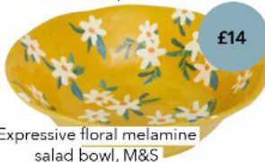
Expressive floral melamine salad bowl, M&S