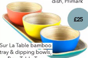
Sur La Table bamboo tray & dipping bowls, Pure Table Top