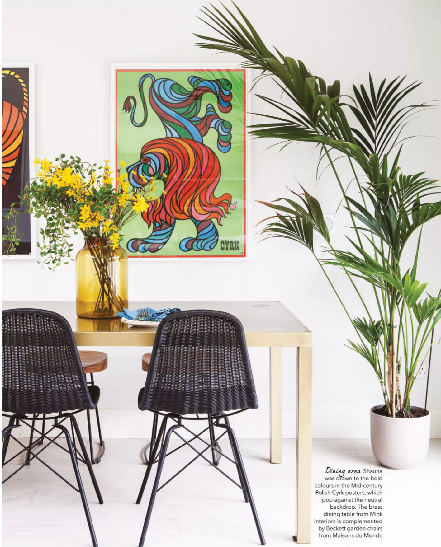
Dining area Shauna was drawn to the bold colours in the Mid-century Polish Cyrk posters, which pop against the neutral backdrop. The brass dining table from Mink Interiors is complemented by Beckett garden chairs from Maisons du Monde