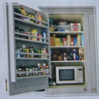
↑ ADD TO A PANTRY Make space for a microwave and install a spice rack on the inside of the door