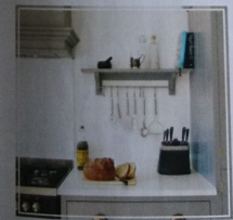
↑ BE CREATIVE WITH WALL SPACE Additional storage with a shelf is perfect for hanging utensils from

Take Elena's neat tricks into account when planning your own kitchen project