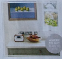
↑ TRY A RESILIENT ALTERNATIVE Durable marble-effect quartz has the look of stone but won't stain