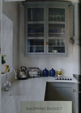
TRADITIONAL LOOK Quartz worktops and grey cabinetry add to the classic feel