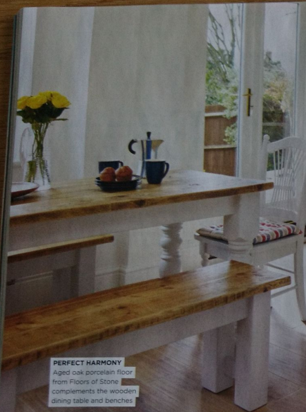
PERFECT HARMONY Aged oak porcelain floor from Floors of Stone complements the wooden dining table and benches