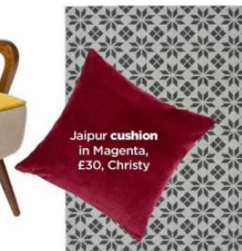
Jalpur cushion in Magenta, £30, Christy