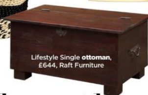
Lifestyle Single ottoman, £644, Raft Furniture