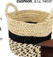
Woven rope basket, £14, Matalan