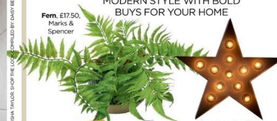
Broadway star table lamp, £99, made.com