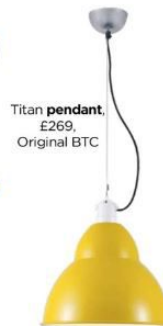
Titan pendant, £269, Original BTC