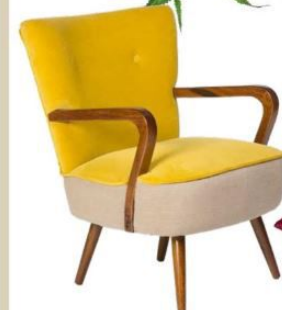
Calvin armchair in mustard yellow velvet and linen, £399, Atkin and Thyme