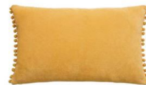
Soft velour pom edge cushion, £12, Next