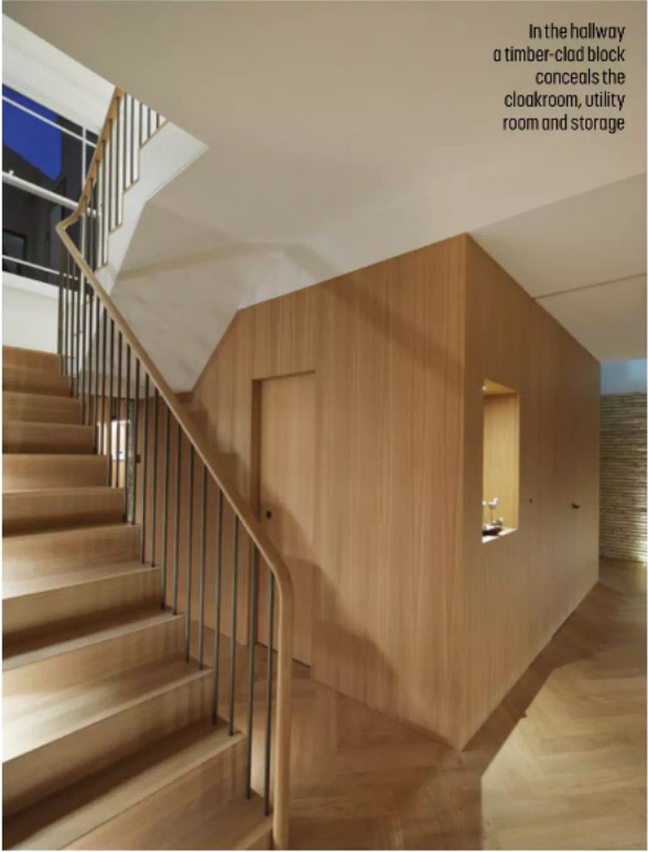
In the hallway a timber-clad block conceals the cloakroom, utility room and storage