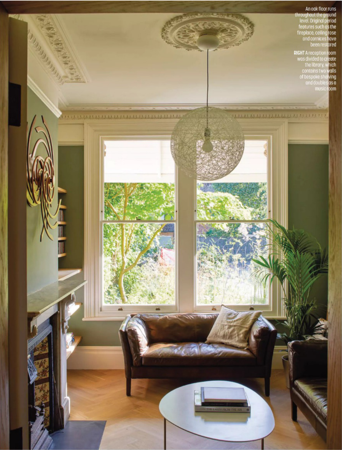
An oak floor runs throughout the ground level. Original period features such as the fireplace, ceiling rose and cornices have been restored RIGHT A reception room was divided to create the library, which contains two walls of bespoke shelving and doubles as a music room