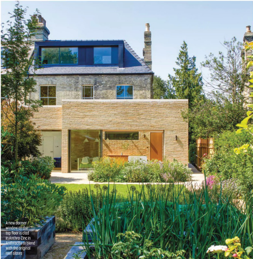
A new dormer window on the top floor is clad in Anthra-Zinc in Anthracite to blend with the original roof slates