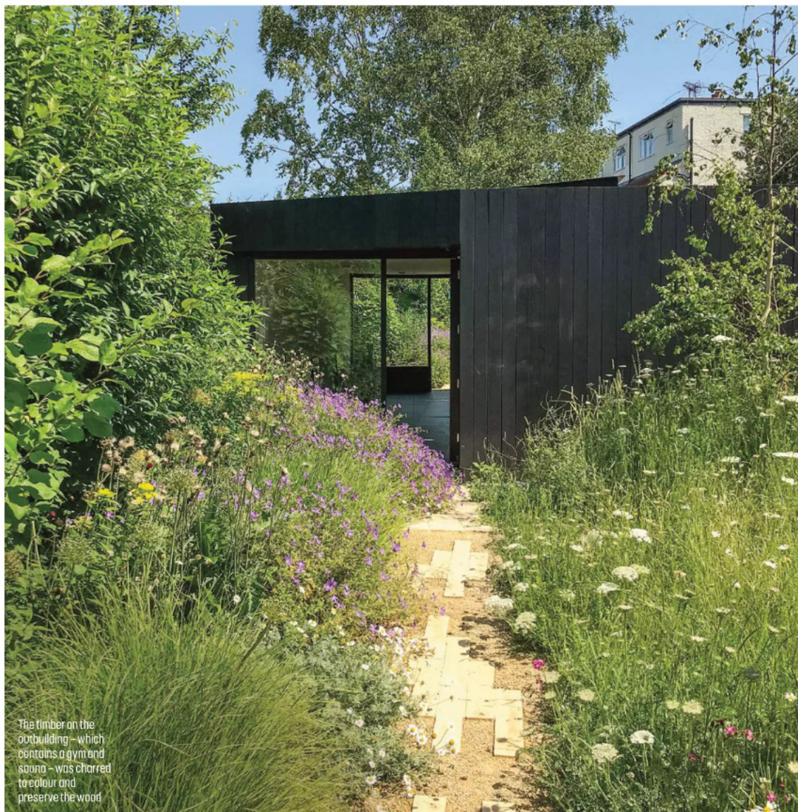
The timber on the outbuilding – which contains a gym and sauna – was charred to colour and preserve the wood