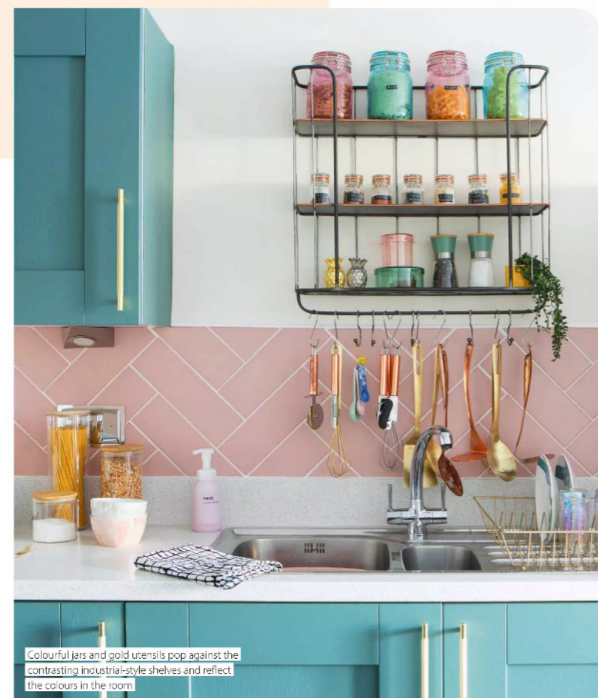
Colourful jars and gold utensils pop against the contrasting industrial-style shelves and reflect the colours in the room