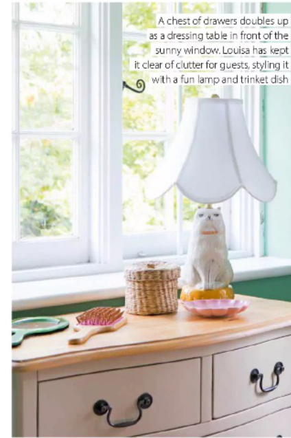
A chest of drawers doubles up as a dressing table in front of the sunny window. Louisa has kept it clear of clutter for guests, styling it with a fun lamp and trinket dish