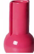
HKLiving ceramic Hot Pink vase, £24, Spicer & Wood