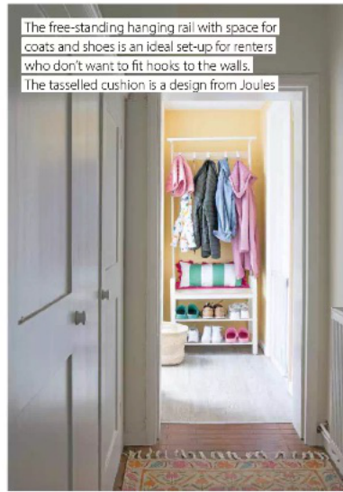
The free-standing hanging rail with space for coats and shoes is an ideal set-up for renters who don't want to fit hooks to the walls. The tasselled cushion is a design from Joules