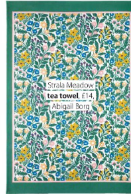
Strala Meadow tea towel, £14, Abigail Borg