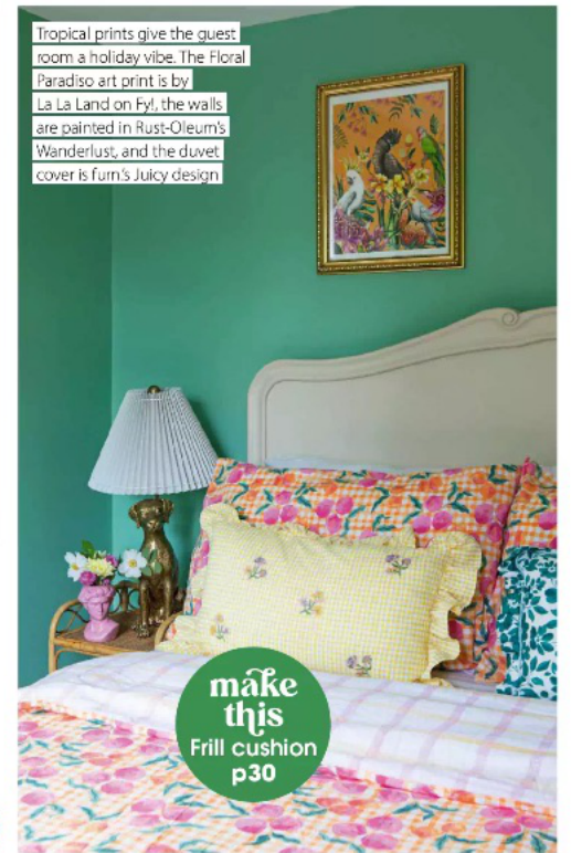
Tropical prints give the guest room a holiday vibe. The Floral Paradise art print is by La La Land on Fyl, the walls are painted in Rust-Oleum's Wanderlust, and the duvet cover is from Juicy design

'We didn't want to spend too much on this room, so it was lucky we were able to make use of furniture we already had from the bedroom in our previous flat. We've used various shades of green elsewhere in the house so effectively, so I knew it would work beautifully in here too. As it's not one of the main rooms, I decided to experiment with a slightly stronger shade – a spearmint green – and was really pleased when I found this duvet cover with details in the same colour. I couldn't resist the dog table lamp as it looks exactly like our mixed breed dog called Lana.'