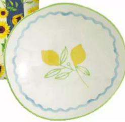
Wobbly lemon ceramic salad bowl, £8, Dunelm