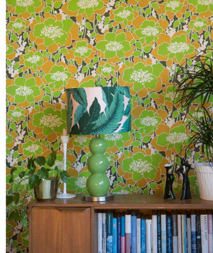
CLOCKWISE FROM ABOVE LEFT The wall-mounted flying mallard ducks were originally made in the Beswick Factory and considered an affordable design feature during the Sixties and Seventies; Gillian sources her table lamps from Harvest Moon Lamps. Vintage orange and green floral wallpaper from Vintage Wallpapers has a similar look to this; in the long living room, the main wall is decorated in chocolate brown, and large doors fold back to reveal steps up to the roof terrace; a friend made the rectangular dining table in a classic Seventies design, with a laminate top and tubular legs. FACING PAGE Gillian in the living room. Indoor and outdoor plants provide a vibrant green backdrop with a hint of bohemian.