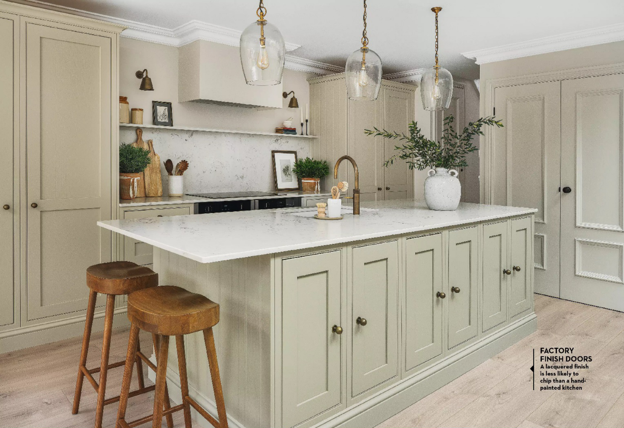
FACTORY FINISH DOORS A lacquered finish is less likely to chip than a hand-painted kitchen

THE PROBLEM We lived with a makeshift kitchen and no heating for two years after moving in