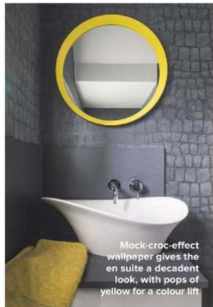
Mock-croc-effect wallpaper gives the en suite a decadent look, with pops of yellow for a colour lift