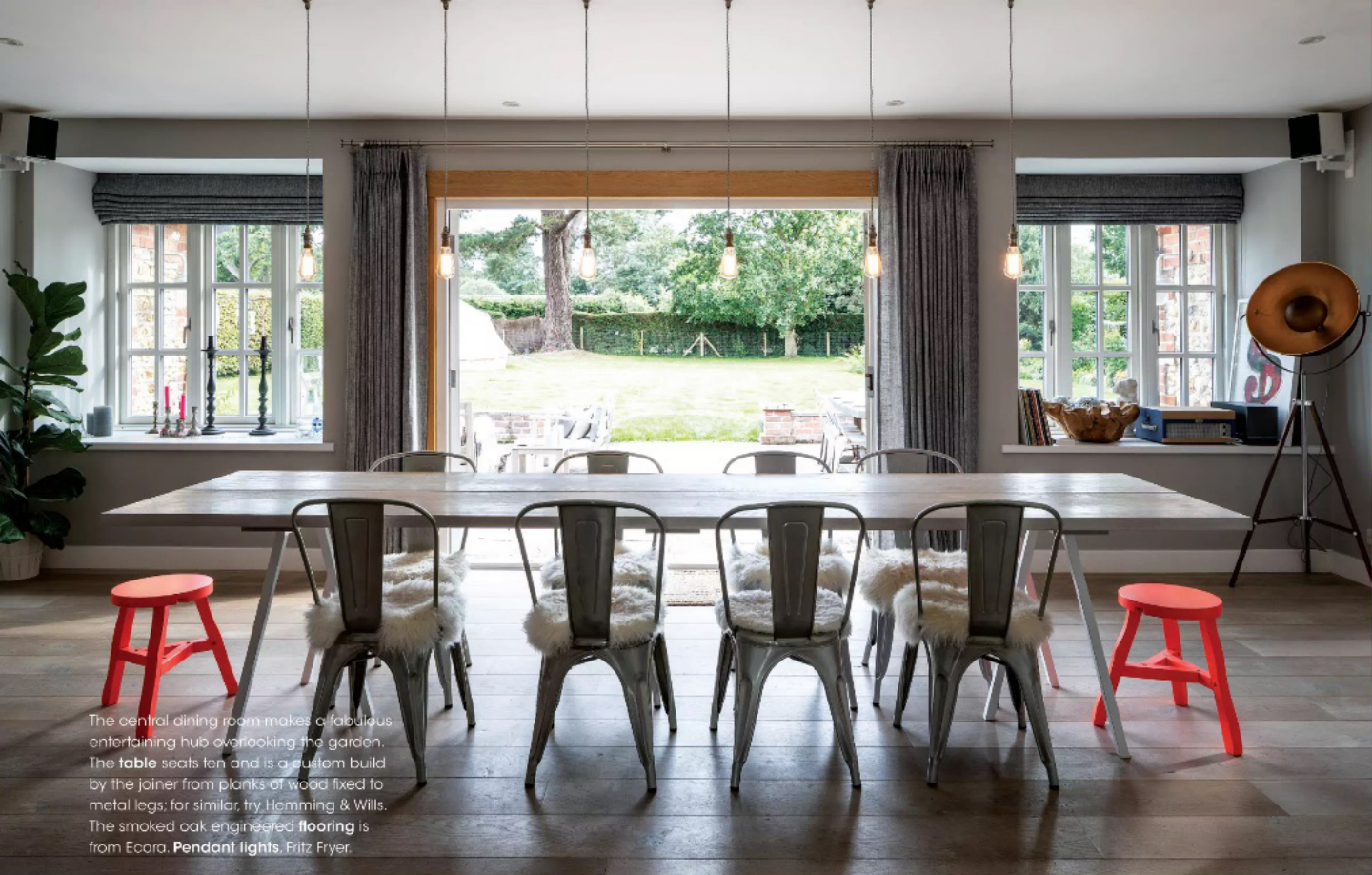
The central dining room makes a fabulous entertaining hub overlooking the garden. The table seats ten and is a custom build by the joiner from planks of wood fixed to metal legs; for similar, try Hemming & Wills. The smoked oak engineered flooring is from Ecora. Pendant lights, Fritz Fryer.