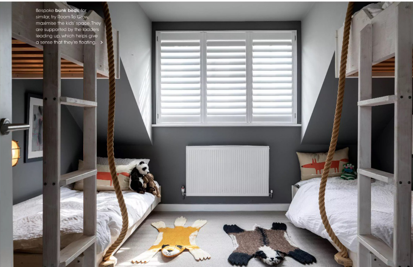
Bespoke bunk beds, for similar, try Room To Grow, maximise the kids' space. They are supported by the ladders leading up, which helps give a sense that they're floating. >