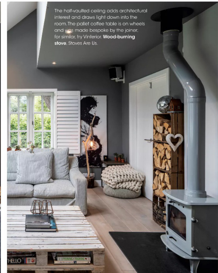
The half-vaulted ceiling adds architectural interest and draws light down into the room. The pallet coffee table is on wheels and was made bespoke by the joiner; for similar, try Vinterior. Wood-burning stove, Stoves Are Us.