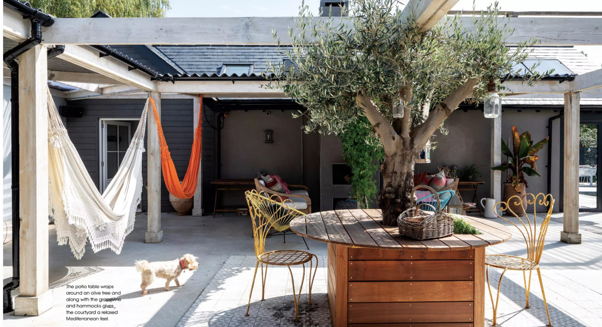
The patio table wraps around an olive tree and along with the grapevine and hammocks gives the courtyard a relaxed Mediterranean feel.