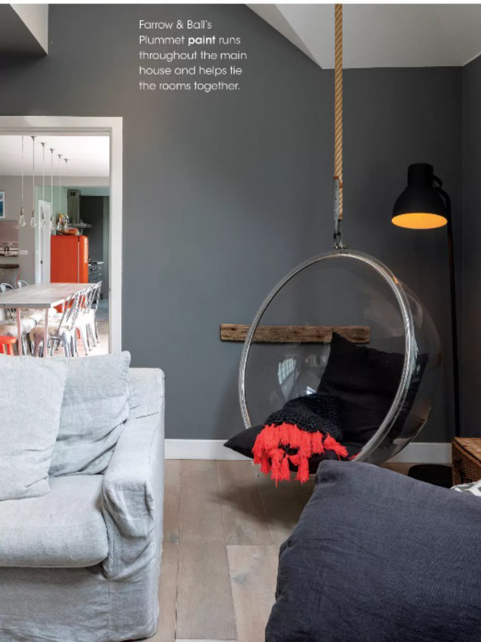
Farrow & Ball's Plummet paint runs throughout the main house and helps tie the rooms together.

#TRENDING Shutters are a great way to control the light and give you privacy