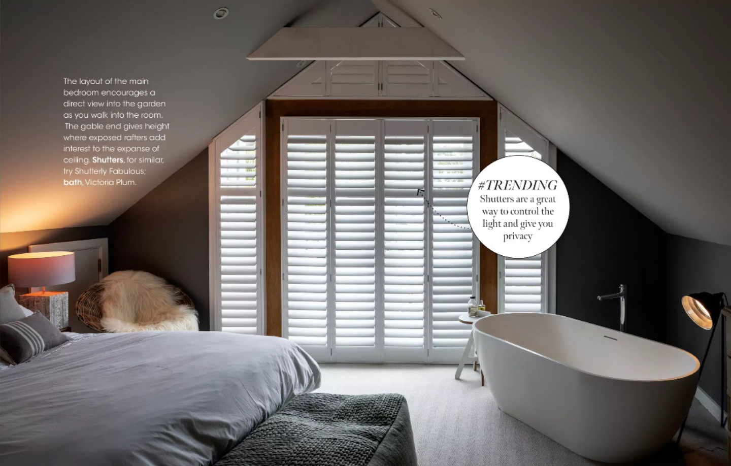
The layout of the main bedroom encourages a direct view into the garden as you walk into the room. The gable end gives height where exposed rafters add interest to the expanse of ceiling. Shutters, for similar, try Shutterly Fabulous; bath, Victoria Plum.

#TRENDING Shutters are a great way to control the light and give you privacy