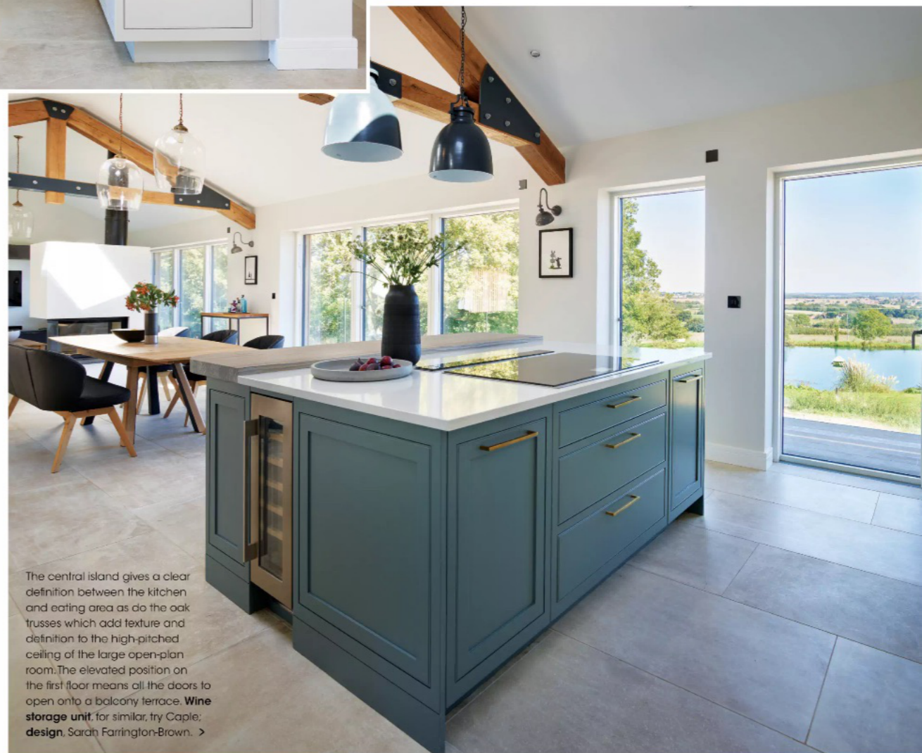
The central island gives a clear definition between the kitchen and eating area as do the oak trusses which add texture and definition to the high-pitched ceiling of the large open-plan room. The elevated position on the first floor means all the doors to open onto a balcony terrace. Wine storage unit , for similar, try Caple; design , Sarah Farrington-Brown. >