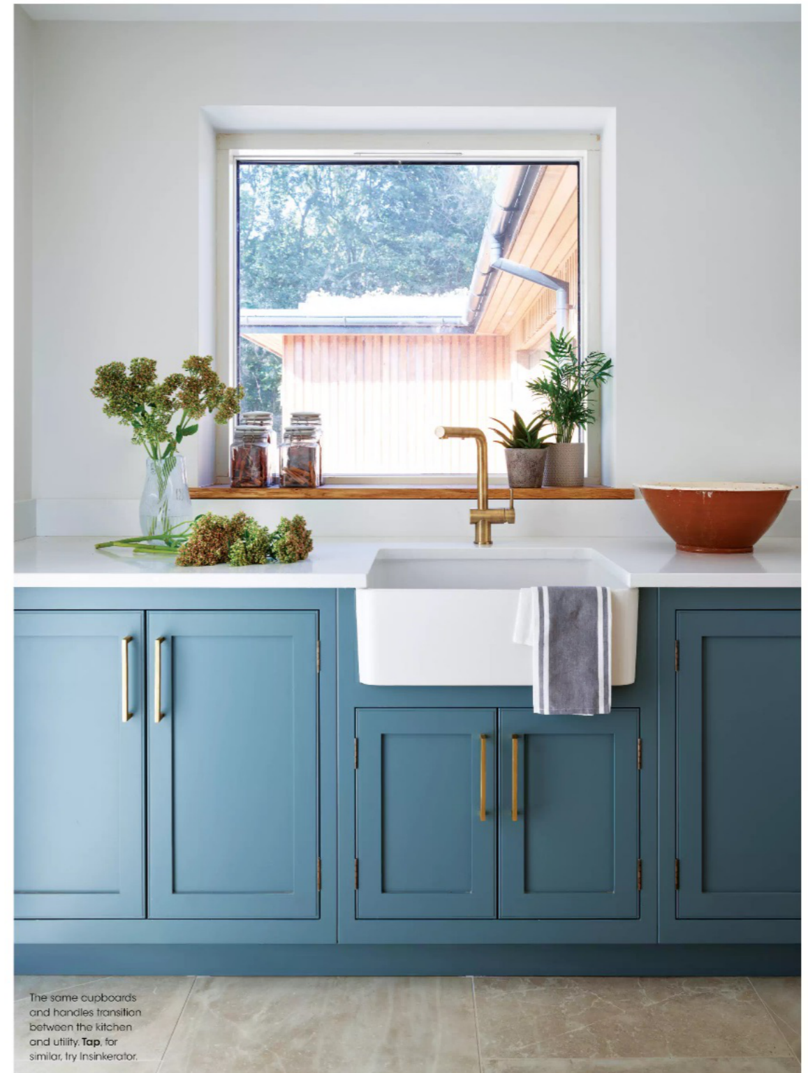
The same cupboards and handles transition between the kitchen and utility. Tap, for similar, try Insinkerator.

Now complete, oversized lighting, art, and discreet plants add the finishing touches to the room, which frames a picture-perfect vista of the lake. "When I come in here, I feel like I'm walking into a lovely living space, where it seems perfectly natural to sit down and enjoy the view," says Sarah. "I love it. Our house is such a special, relaxing place to live." >