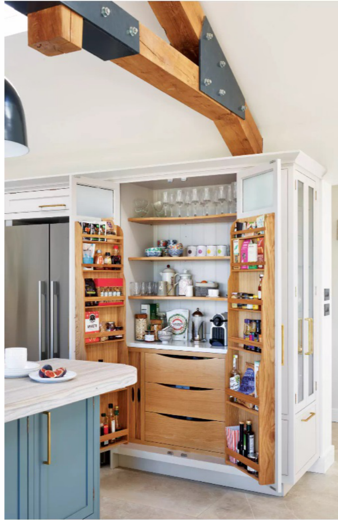
above Inside the pantry cupboard, a quartz shelf is ideal for the coffee and hot chocolate machines, while the deep drawers hold baking supplies. Fridge-freezer, Fisher & Paykel; flooring, Terzetto Stone.