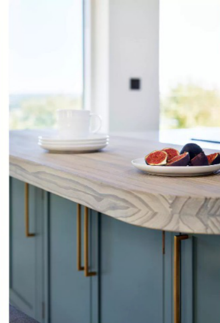
left The textured Spekva river-washed oak breakfast bar , from Harvey Jones, was a must-have for Sarah and contrasts with the smooth finish of the Silestone quartz worktop . Colours in the grey-blue vein were picked out for the cupboards, which have been painted in Farrow & Ball's de Nimes shade.