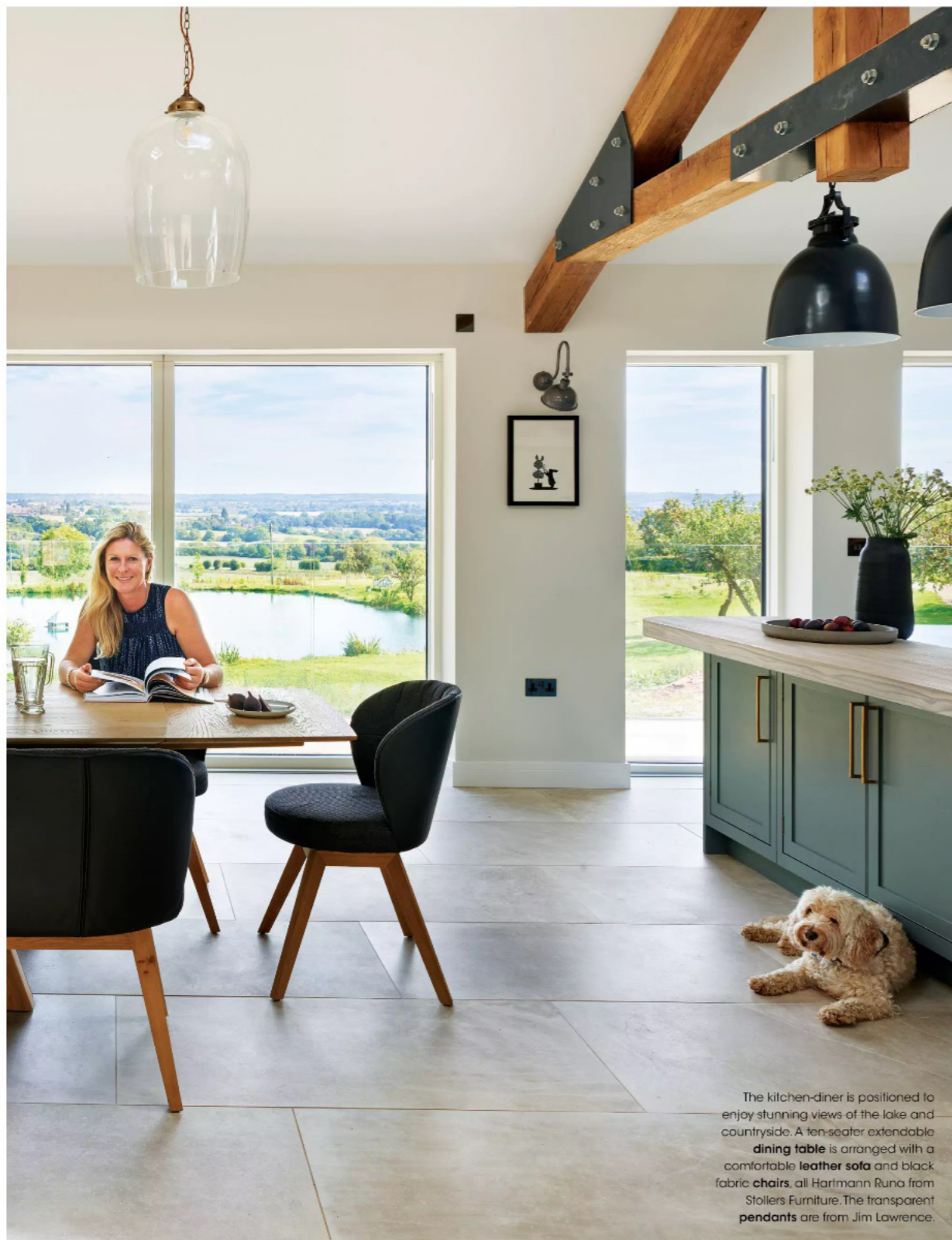
The kitchen-diner is positioned to enjoy stunning views of the lake and countryside. A ten-seater extendable dining table is arranged with a comfortable leather sofa and black fabric chairs , all Hartmann Runa from Stollers Furniture. The transparent pendants are from Jim Lawrence.