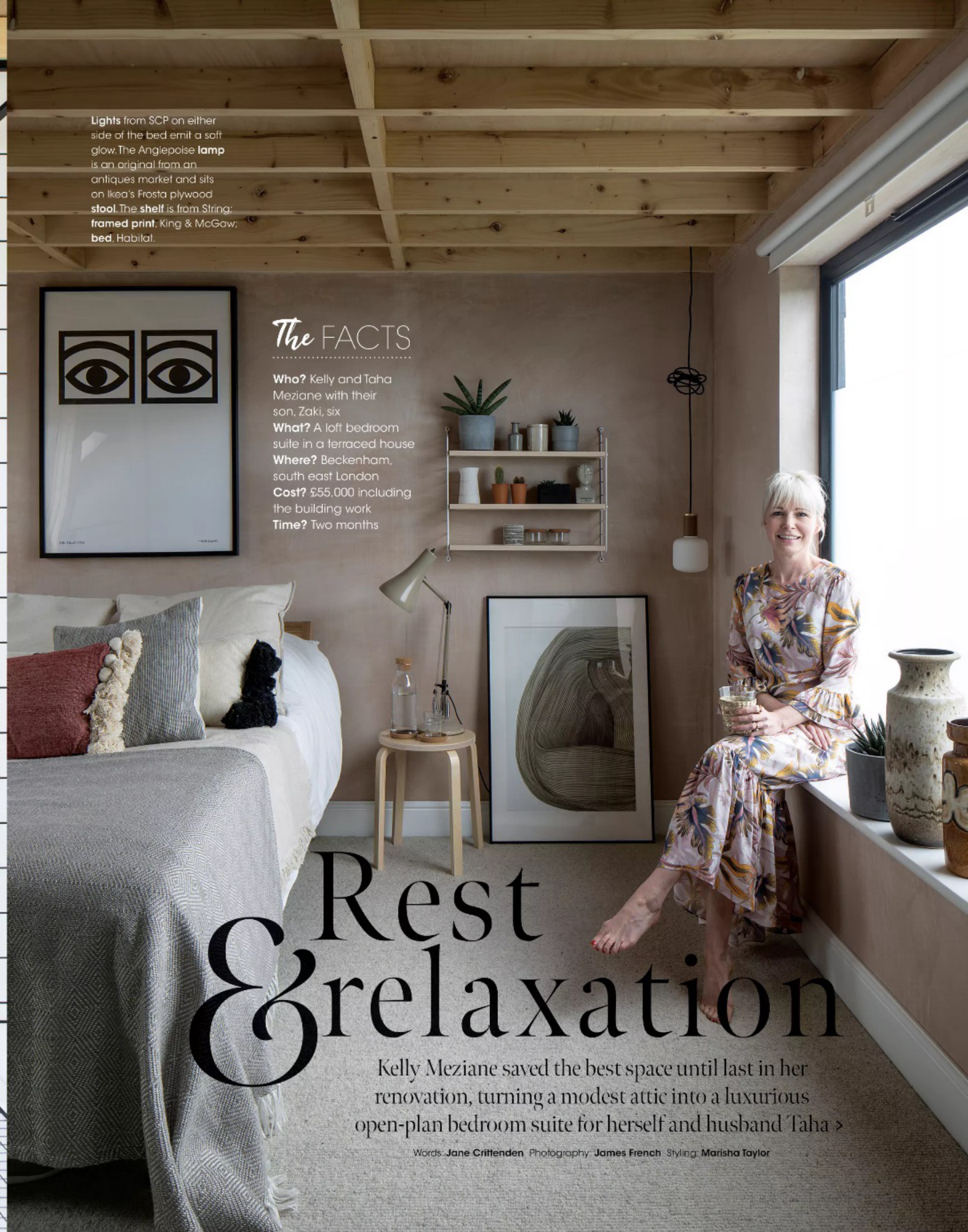
Lights from SCP on either side of the bed emit a soft glow. The Anglepoise lamp is an original from an antiques market and sits on Ikea's Frosta plywood stool. The shelf is from String; framed print, King & McGaw; bed, Habitat.