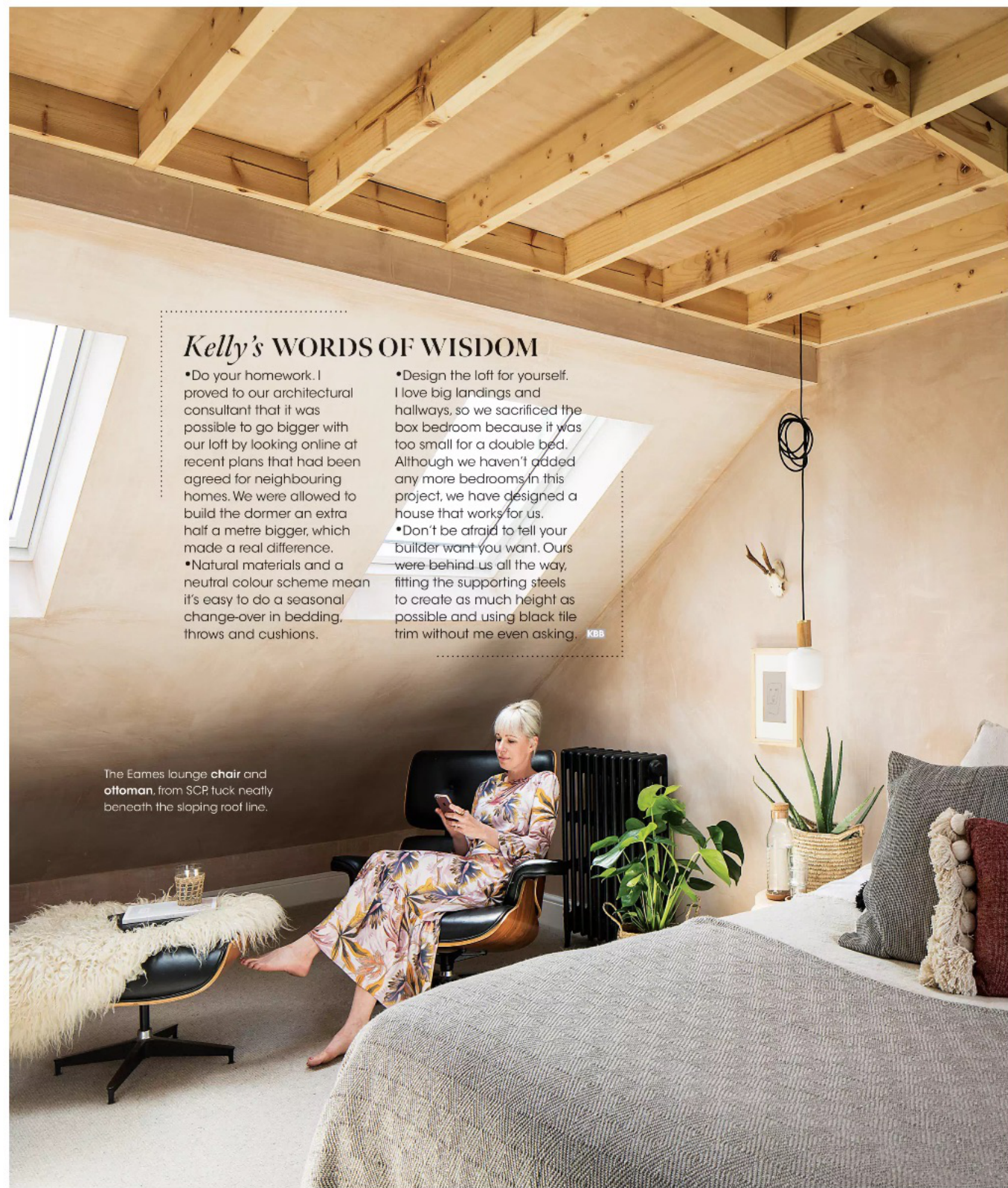
The Eames lounge chair and ottoman, from SCP, tuck neatly beneath the sloping roof line.