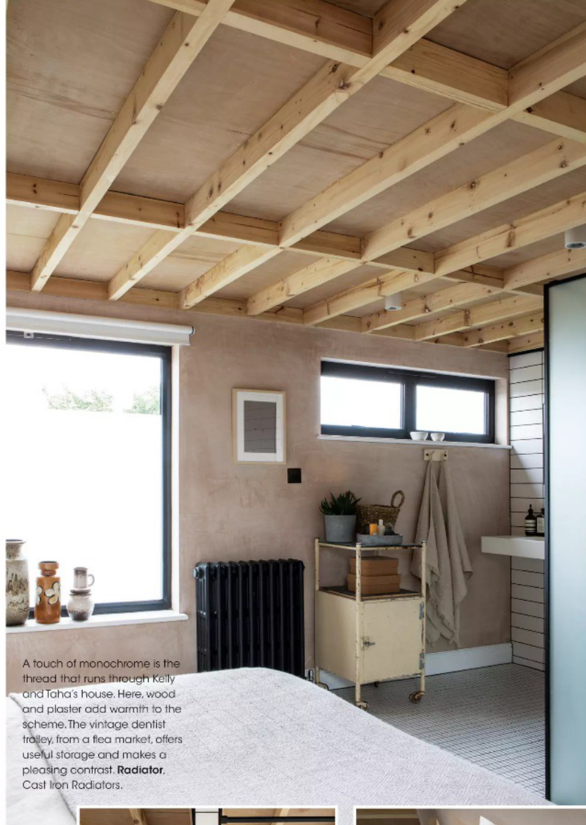
A touch of monochrome is the thread that runs through Kelly and Taha's house. Here, wood and plaster add warmth to the scheme. The vintage dentist trolley, from a flea market, offers useful storage and makes a pleasing contrast. Radiator. Cast Iron Radiators.