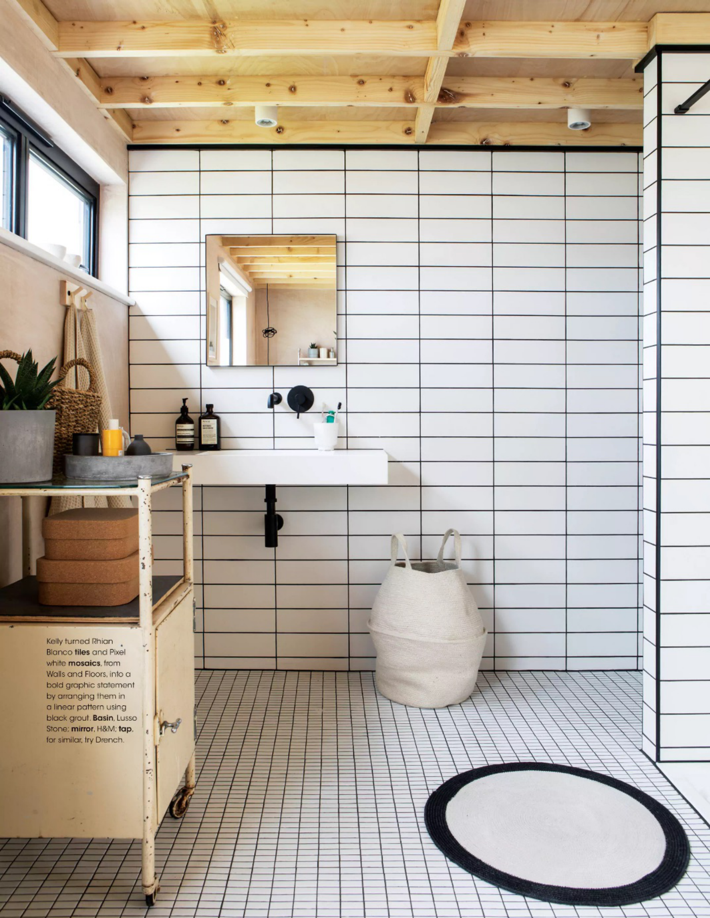
Kelly turned Rhian Blanco tiles and Pixel white mosaics, from Walls and Floors, into a bold graphic statement by arranging them in a linear pattern using black grout. Basin , Lusso Stone; mirror , H&M; tap , for similar, try Drench.