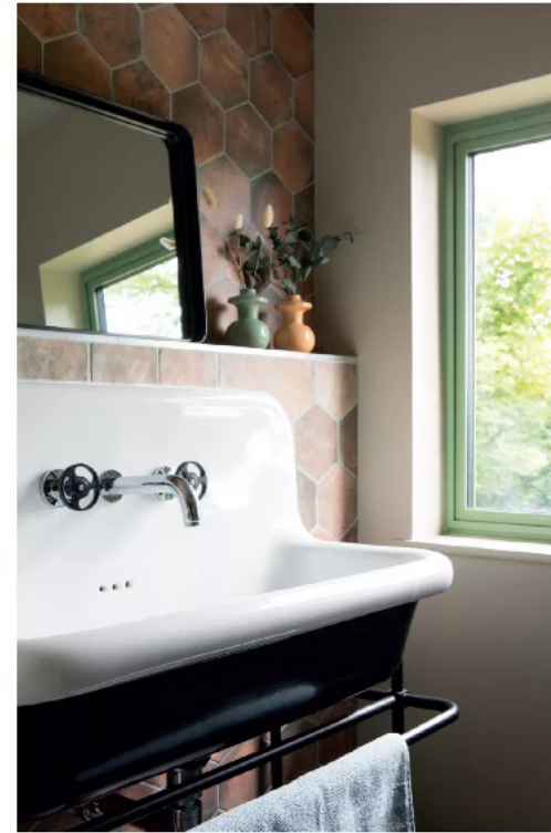
left Country Hexagon Cotto wall tiles, from Baked Tiles. Clearwater's Formosa Grande bath, from Bathroom One.

right The vintage-style washstand came from a bathroom clearance sale. For a similar design, see the Taylor model at Viadurini.