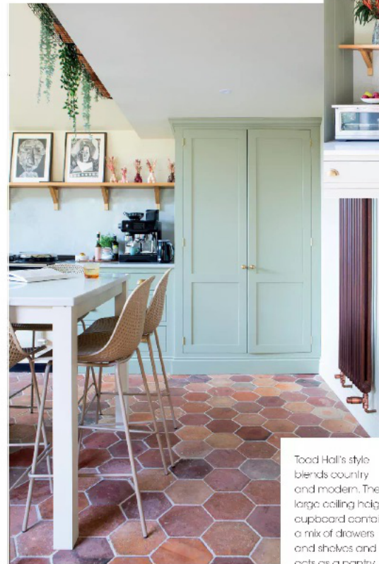
Toad Hall's style blends country and modern. The large ceiling height cupboard contains a mix of drawers and shelves and acts as a pantry.

"BEING IN NATURE IS IMPORTANT FOR OUR WELLBEING AND WE WANTED TO BRING THAT FEELING INSIDE"