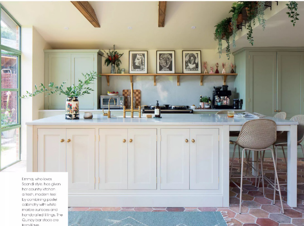
Emma, who loves Scandi style, has given her country kitchen a fresh, modern feel by combining pastel cabinetry with white marble surfaces and handcrafted fillings. The Quinby bar stools are from Kave.