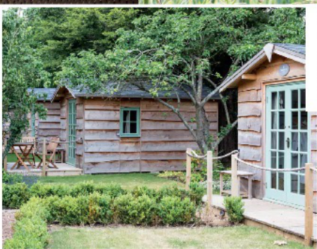
Rustic wood cladding and green painted windows allow the hand-built guest lodges to blend into the natural environment.

Sourcebook Retreat Toad Hall Lodges toadhall.life Building contractor N&R Road Builders 07887 558452 Lodge carpenter Welwyn Carpentry welwyncarpentry.co.uk Kitchen Grahame Bolton Kitchens gibolton.co.uk Appliances Sago sagoappliances.com ; Miele miele.co.uk ; Fisher & Paykel fisherpaykel.com Windows Craftwork Conservatories and Windows 01 502 562 835 Terracotta floor tiles Heritage Ceramics heritageceramics.co.uk Bathroom tiles Baked Tiles bakedtiles.co.uk Bathroom Thomas Cropper thomas-cropper.com ; Bathroom One bathroomone.co.uk ; Viadurini viadurini.co.uk For full stockist information, see page 126 Search for more suppliers at thesotherooms.com/directory