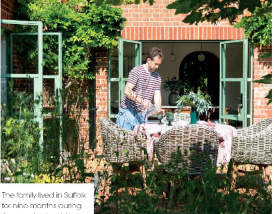
The family lived in Suffolk for nine months during the pandemic, giving them the chance to really get to know the property and the best outdoor spots for different times of the day.