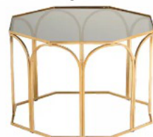
SMOKED GLASS Arch coffee table, £175, Next