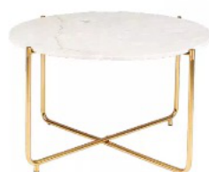
SMART BRASS Gloria coffee table, £215, Rose & Grey

Get the luxe look for less with these chic buys