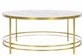
IN THE ROUND Roma coffee table, £349, Cult Furniture