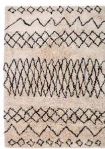
BERBER STYLE Wood Nando rug, from £249, Cuckooland.com