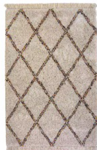
WHAT A DIAMOND Safi Ethnic Diamond rug, from £59.99, Carpetright