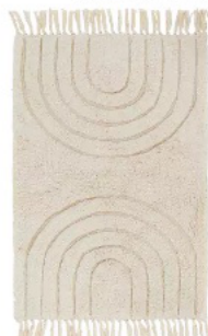
FABULOUS FRINGE Bhodi rug, £30, Walton & Co

Choose a soft rug to add warmth and character