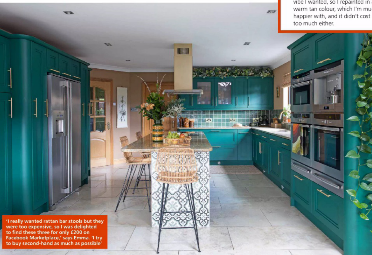
'I really wanted rattan bar stools but they were too expensive, so I was delighted to find these three for only £200 on Facebook Marketplace,' says Emma. 'I try to buy second-hand as much as possible'