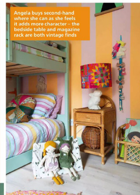
Angela buys second-hand where she can as she feels it adds more character – the bedside table and magazine rack are both vintage finds

It's a great way to personalise furniture, if you're not confident with hand-painting yourself – you can buy slogans, spots and other motifs to stick on walls or furniture for an easy update.