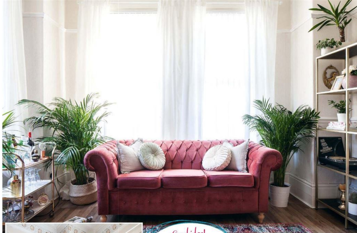
◀ The living room has pretty period detailing and tall windows that Hayley dressed in a plain voile. IKEA plants bring in fresh greenery and frame the eye-catching second-hand sofa which tones with the Wayfair Persian rug. For a similar sofa, try the dark pink Metro Lane Chesterfield, also by Wayfair

The free-standing roll-top bath was Hayley’s must-have item, but with a lack of space for a separate shower enclosure, she sourced a design that could be used with an overhead shower. Next, Hayley turned her attention to the kitchen but without a meaningful budget she decided to temporarily update the room. After a period of saving, she splurged on a pink Smeg fridge-freezer, and the kitchen sprung up around it. ‘I’ve wanted a pink Smeg for years,’ she says. ‘The pastel