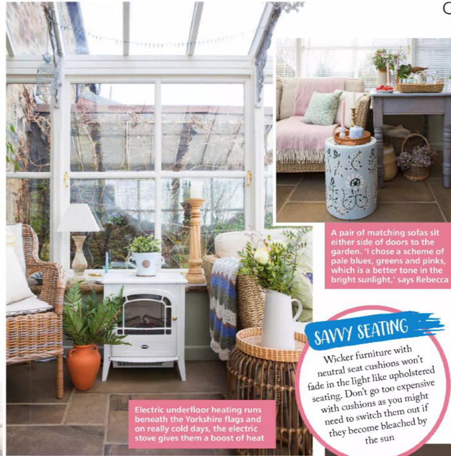
A pair of matching sofas sit either side of doors to the garden. 'I chose a scheme of pale blues, greens and pinks, which is a better tone in the bright sunlight,' says Rebecca