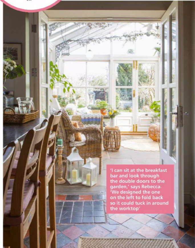
'I can sit at the breakfast bar and look through the double doors to the garden,' says Rebecca. 'We designed the one on the left to fold back so it could tuck in around the worktop'

had the back door, an old washroom and a store, but access to the latter two was from the garden, which was totally impractical,' Rebecca explains. 'The conservatory now incorporates these spaces, and we turned them into a cloakroom and utility.'