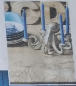
✦ Inspired by the octopus candlestick, Emma used her new pyrography pen skills to burn a tentacles etching onto the wooden table