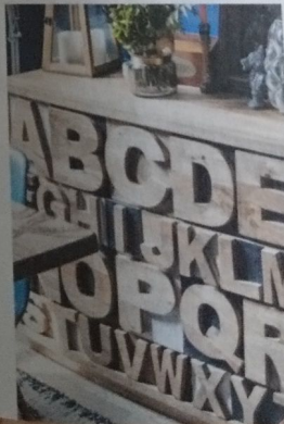
✦ The mango wood letter drawers were a lucky find on Gumtree

'I never spend a lot of money on projects, then it doesn't matter if something doesn't work and I need to try a different approach.'