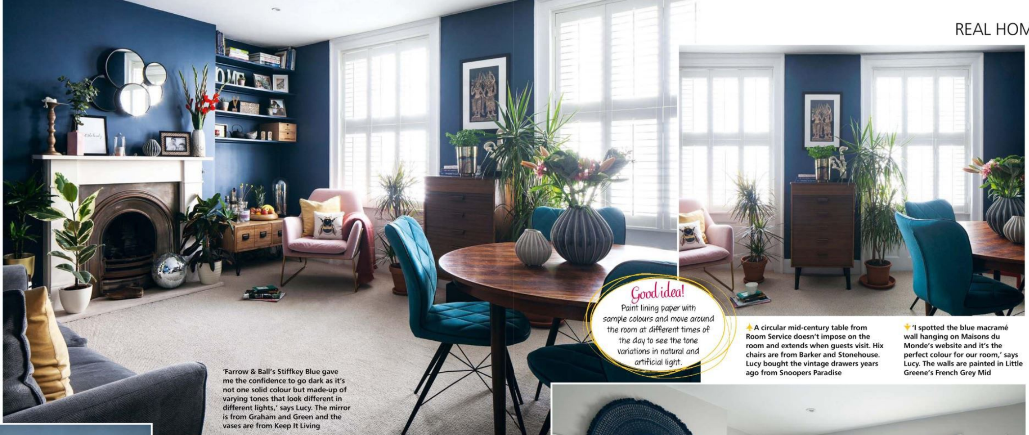
'Farrow & Ball's Stiffkey Blue gave me the confidence to go dark as it's not one solid colour but made-up of varying tones that look different in different lights,' says Lucy. The mirror is from Graham and Green and the vases are from Keep It Living

Good idea! Paint lining paper with sample colours and move around the room at different times of the day to see the tone variations in natural and artificial light.