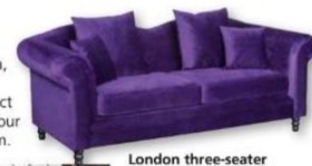
London three-seater sofa , £649.99, Wayfair

Plump for a striking purple sofa, like Jules did, to inject instant colour into a room.