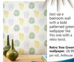
Jazz up a bedroom wall with a bold patterned green wallpaper like this one with a retro twist.