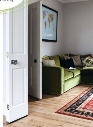
The couple put the wall back between the two reception rooms. 'There was a lot of wasted space as one big room,' says Jules. 'The velvet green sofa bed we bought from Sofa.com is great here as the girls can have sleepovers without bothering us!'

Sliding-folding doors make the two downstairs living rooms a flexible space for privacy and entertaining.