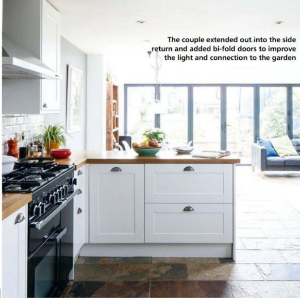
The couple extended out into the side return and added bi-fold doors to improve the light and connection to the garden

salon, and the couple revamped the family bathroom. The years passed and the couple decided to sell their London house that they had been renting out to fund the renovations in the rest of their home.