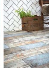
Wood-effect porcelain plank tiles have a textured finish like Jules' rustic kitchen floor.