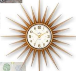
Starburst clock , £39.95, Scotts of Stow

Vintage style is easy to achieve with this iconic clock design.