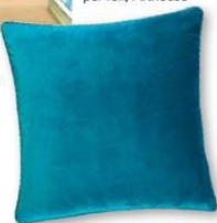
Large teal velvet cushion , £12.99, Matalan

Follow Jules' lead and dress up your sofa with this sumptuous teal velvet cushion.