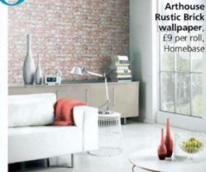
Arthouse Rustic Brick wallpaper , £9 per roll, Homebase

Copy the industrial look without the hassle with a brick print wallpaper.