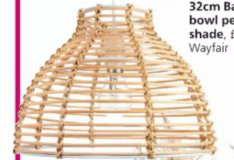
32cm Bamboo bowl pendant shade, £30.99, Wayfair