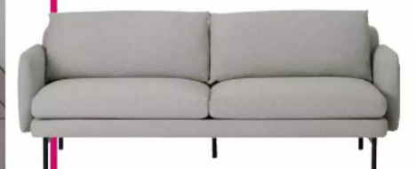
Miro three-seater sofa, £599, Made.com