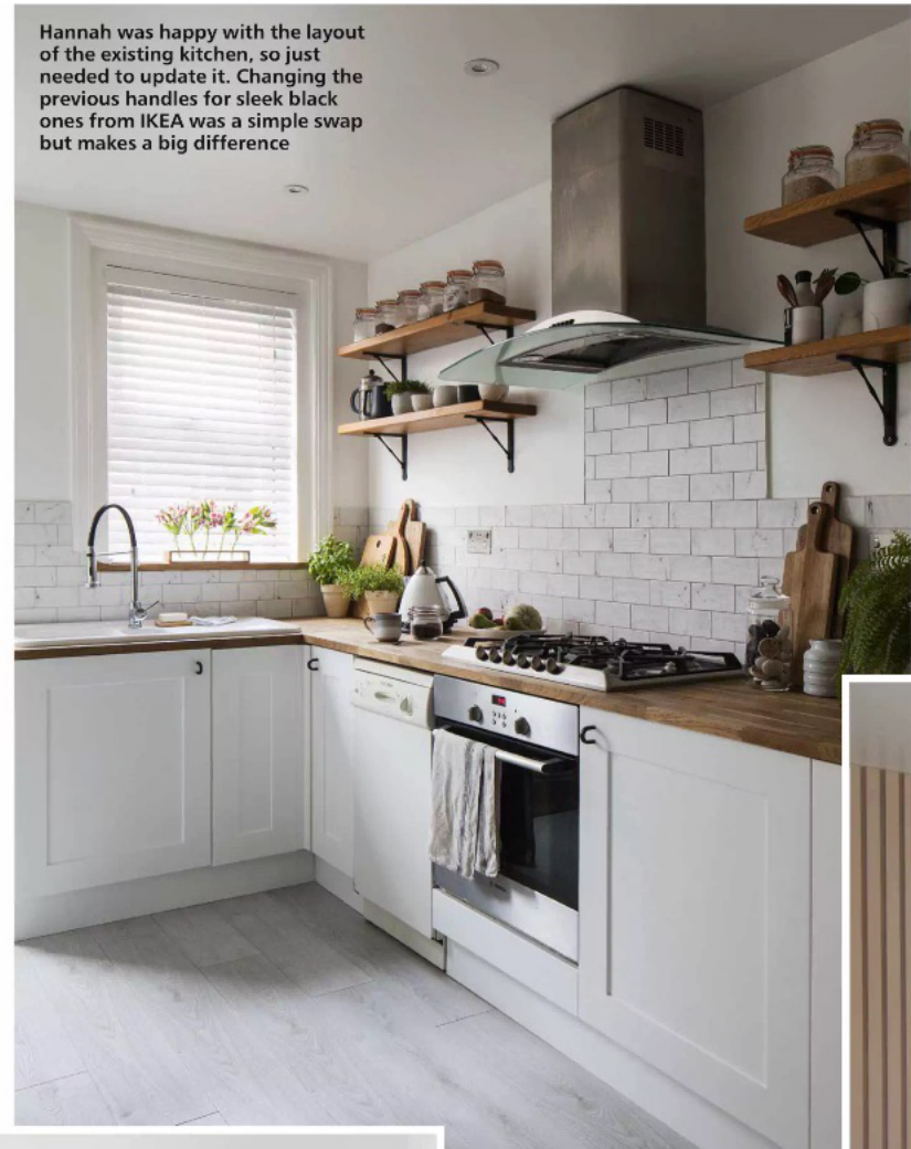
Hannah was happy with the layout of the existing kitchen, so just needed to update it. Changing the previous handles for sleek black ones from IKEA was a simple swap but makes a big difference

in luxury travel and was fortunate to stay in hotels all over the world, which was a good way to try out different interior styles,' she says. 'I'm always drawn to white, bright spaces where the decoration isn't too busy. Now I work long hours in wedding sales, and I wanted to come home and feel relaxed.'