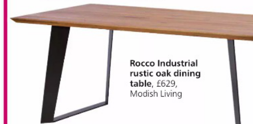
Rocco Industrial rustic oak dining table, £629, Modish Living