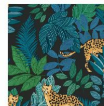
ANIMAL MAGIC Envy Cheetin Night, £45 a roll, B&Q

Choose a lush, leafy pattern that will appeal to your wild side!