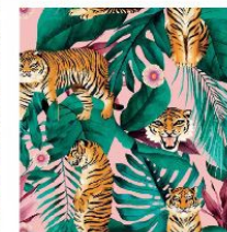
ROAR-SOME PRINT Jungle Is Massive in Sweet Pink, £50 a roll, Lust Home