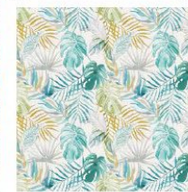
PARADISE PALMS Tropica in Turquoise, £47 a roll, Ohpopsi